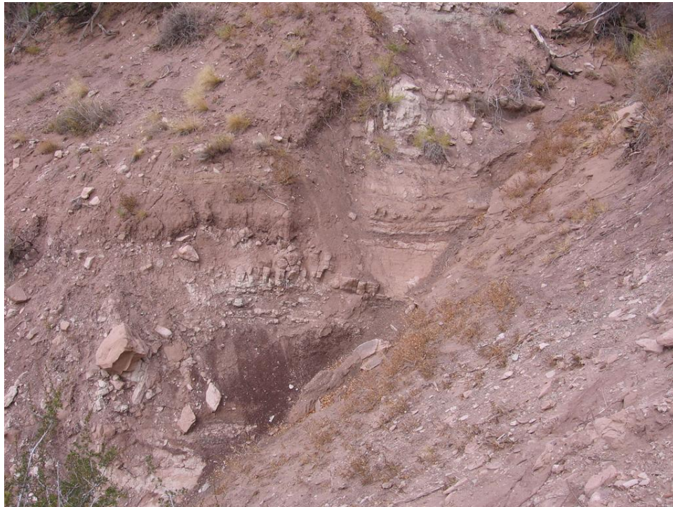
Photo 1. Walking pathway towards mine site washed out