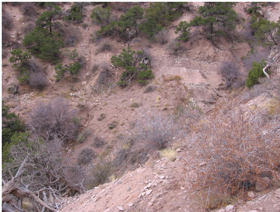
Photo 2. Steep grades towards mine site