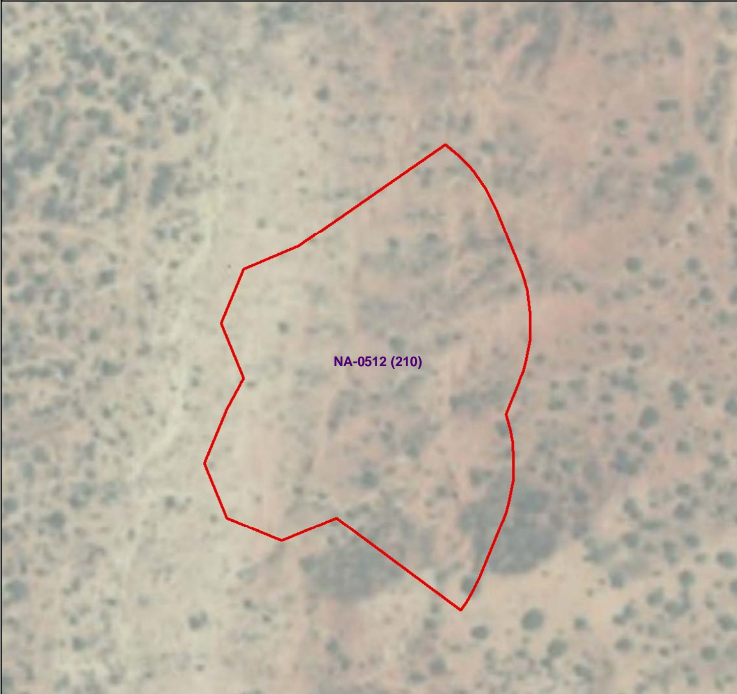
Figure 1 - Site Inaccessible NA-0512 (210) Sweetwater Chapter, Navajo Nation

Weston was unable to access the site during the June 2010 site screenings. All known paths leading towards the site were impassable. See site screen report for documentation.