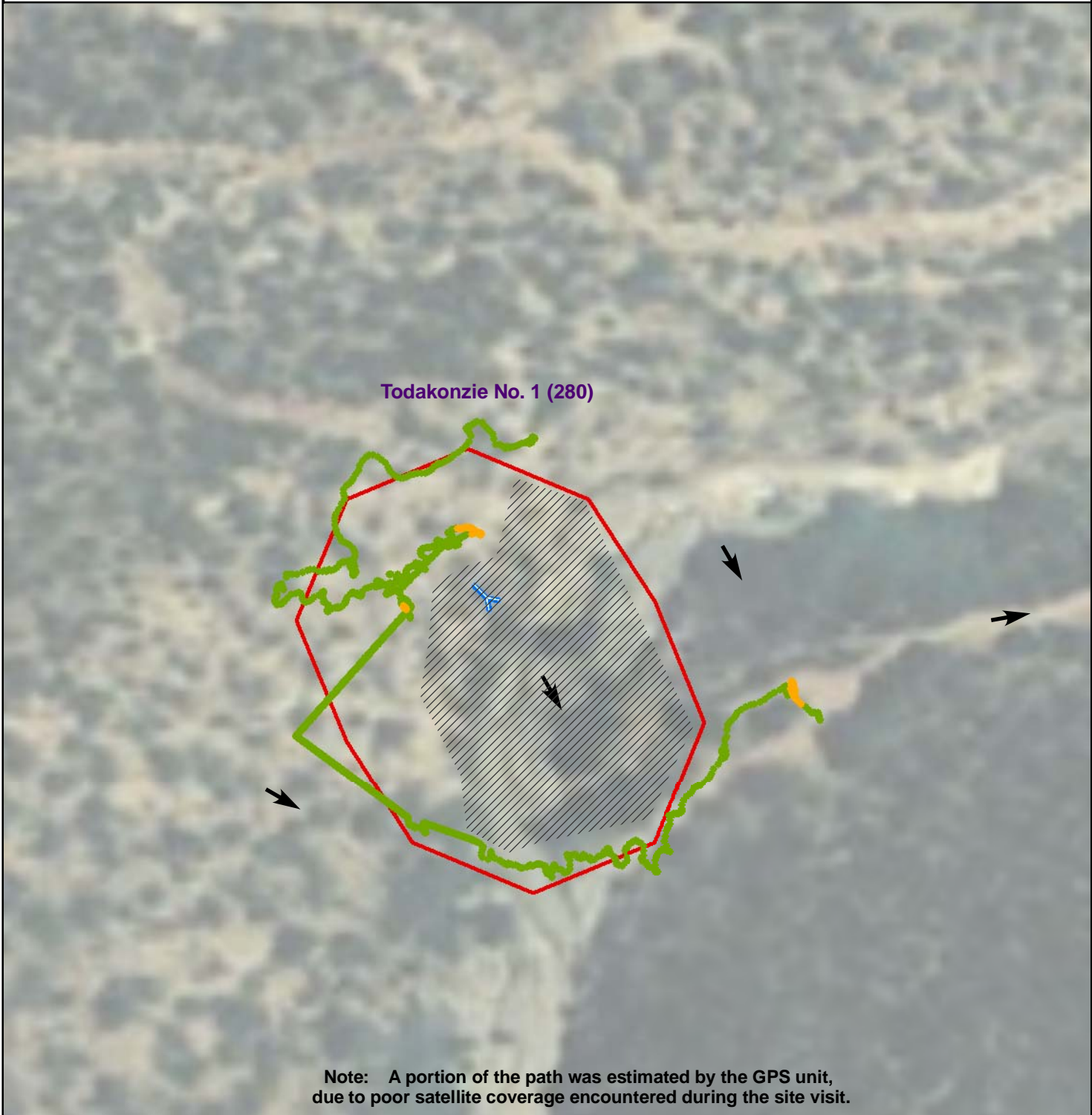
Figure 1 - Gamma Radiation Measurements, Above Two Times Background Todakonzie No. 1 (280) Beclabito Chapter, Navajo Nation

Note: A portion of the path was estimated by the GPS unit, due to poor satellite coverage encountered during the site visit.