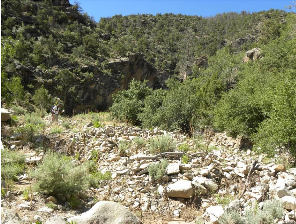
Photo 1. Todakonzie No. 1 mine site