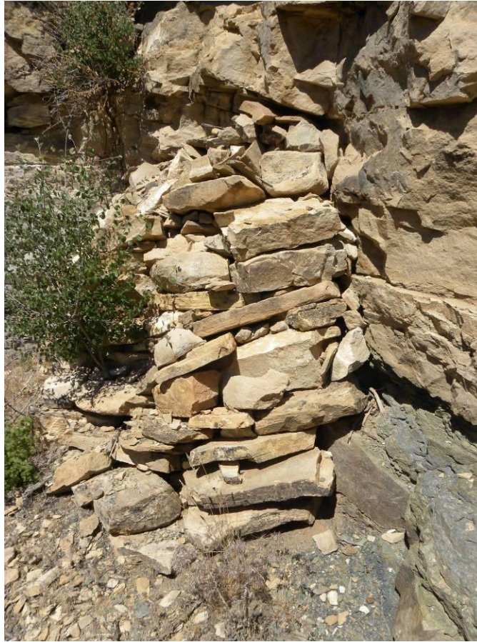
Photo 3. Adit with stone reclamation seal