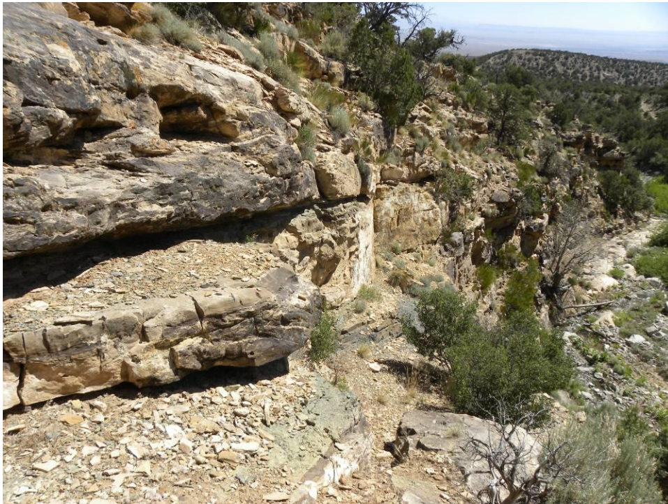
Photo 2. Rim strip operations