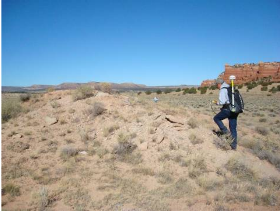
Photo 3. Red Top Mine site, waste rock pile