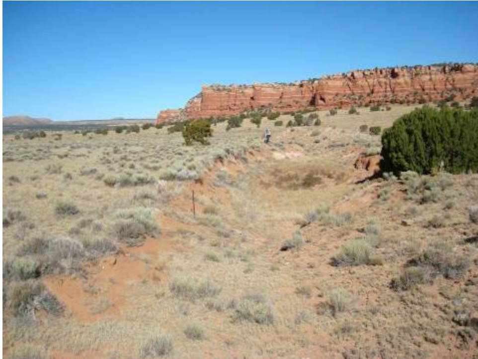
Photo 4. Red Top Mine site, towards the north