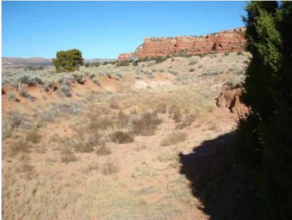
Photo 1. Red Top Mine site, towards the north