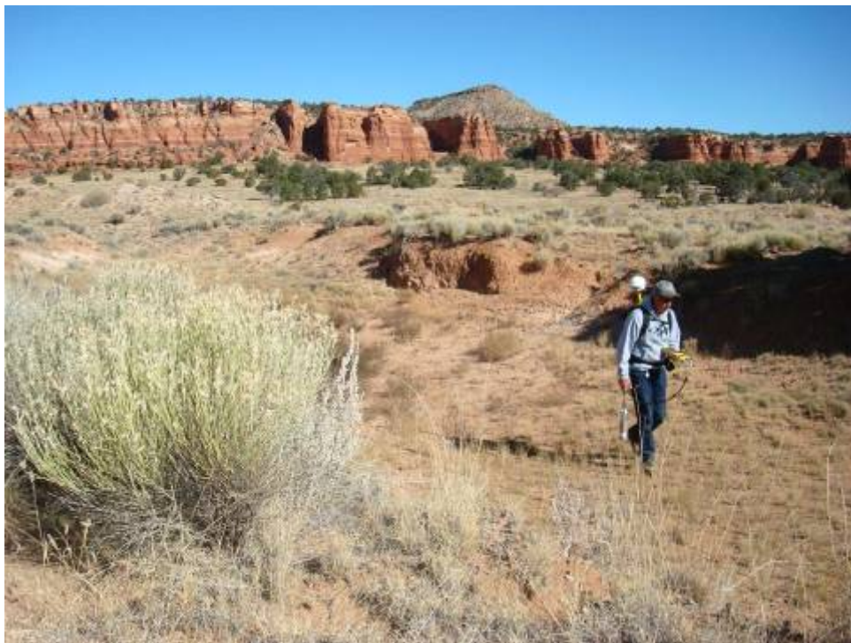
Photo 2. Red Top Mine site, towards the northeast