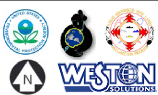
Gamma Radiation Measurements Red Top Baca/Haystack Chapter Navajo Nation, New Mexico Figure 2