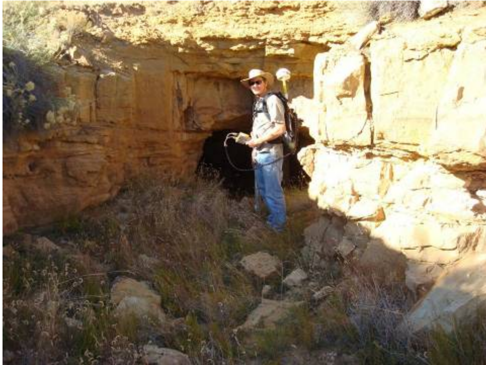
Photo 4. Silver Spur Mine site, adit located at northern edge of mine