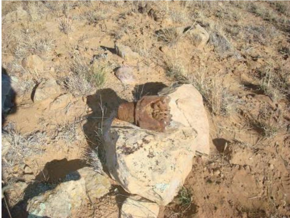
Photo 3. Silver Spur Mine site, tri-cone drill bit observed at site