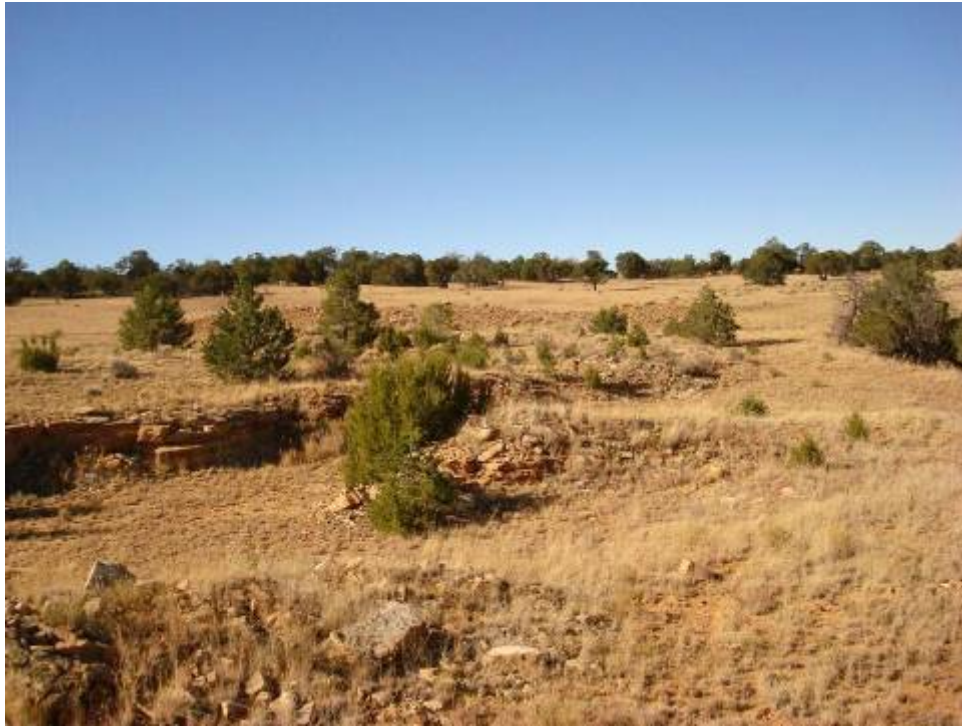
Photo 1. Silver Spur Mine site, towards the northwest. Open pit and waste rock piles