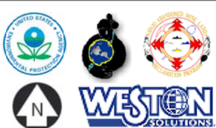
Gamma Radiation Measurements Silver Spur Baca/Haystack Chapter Navajo Nation, New Mexico Figure 2