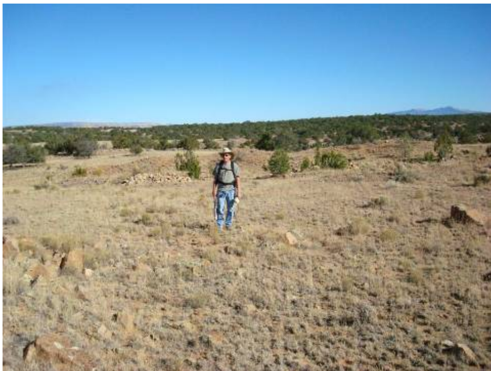
Photo 2. Silver Spur Mine site, towards the south. Waste rock piles in background.