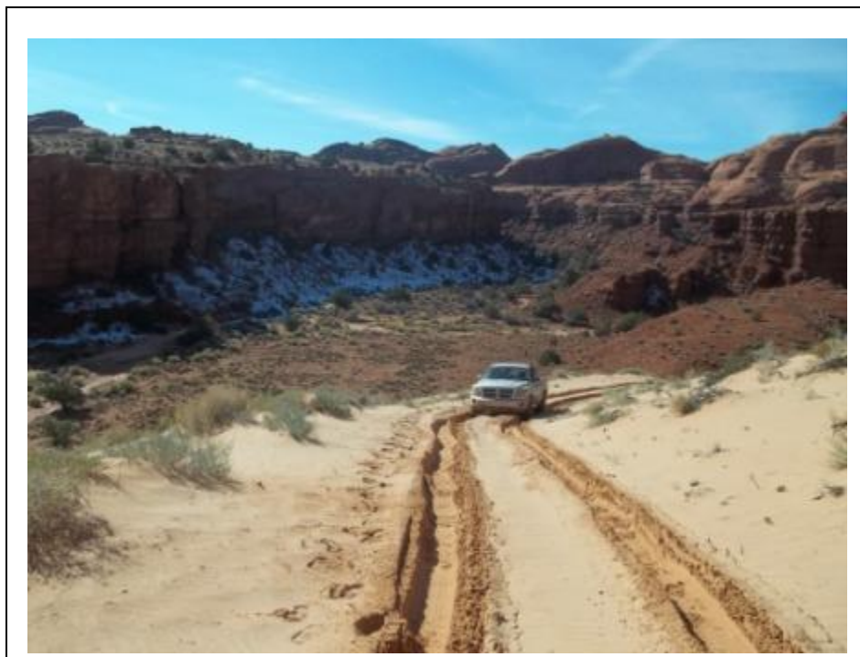
Photo 2 Impassable road in direction of the site