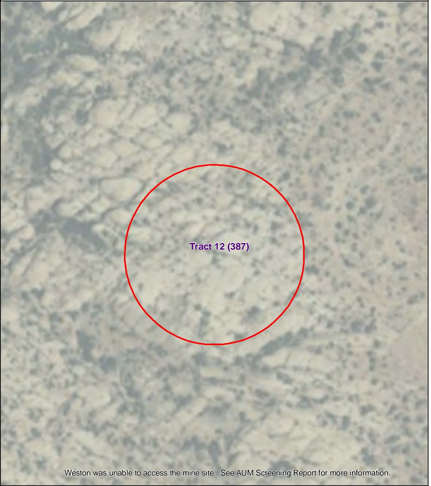
Figure 1 - Inaccessible Tract 12 (387) Oljato Chapter, Navajo Nation

Weston was unable to access the mine site. See AUM Screening Report for more information.