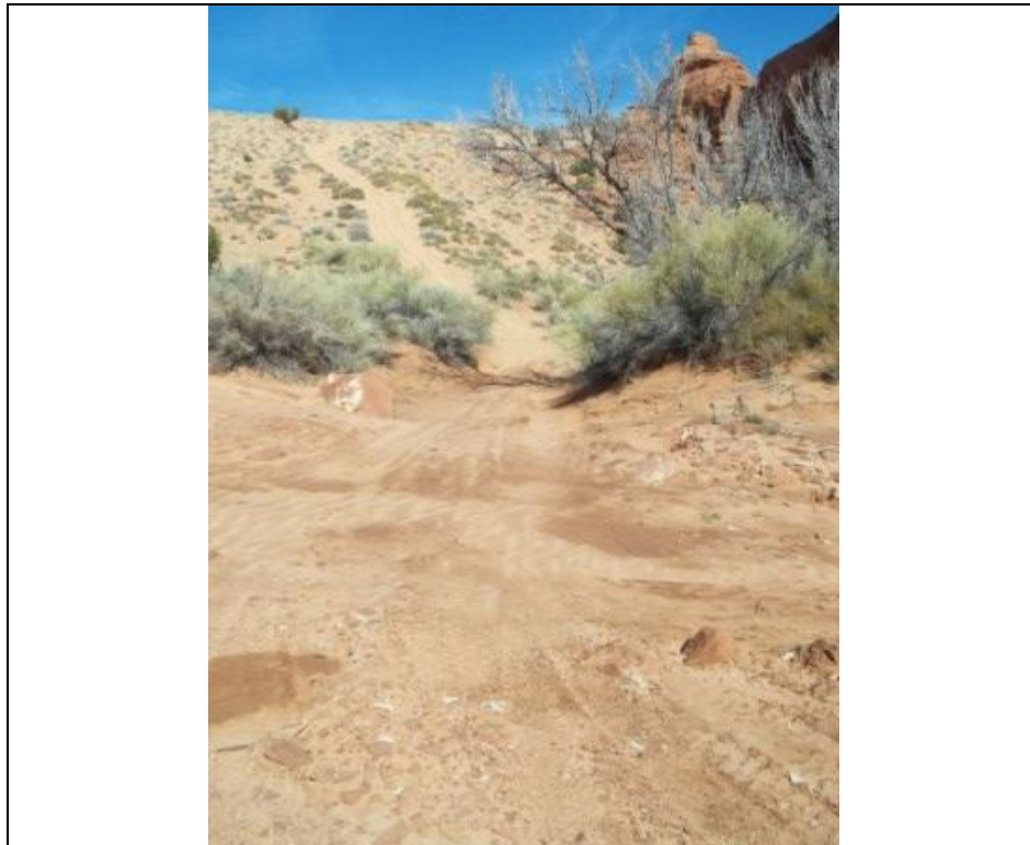
Photo 1 Impassable road in direction of the site