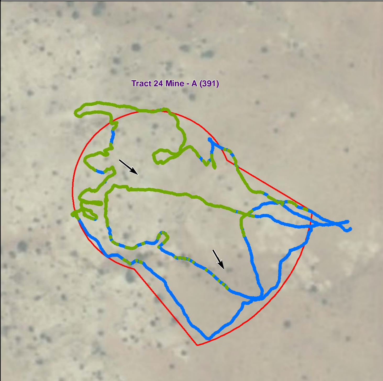
Figure 2 - Gamma Radiation Measurements Tract 24 Mine - A (391) Oljato Chapter, Navajo Nation