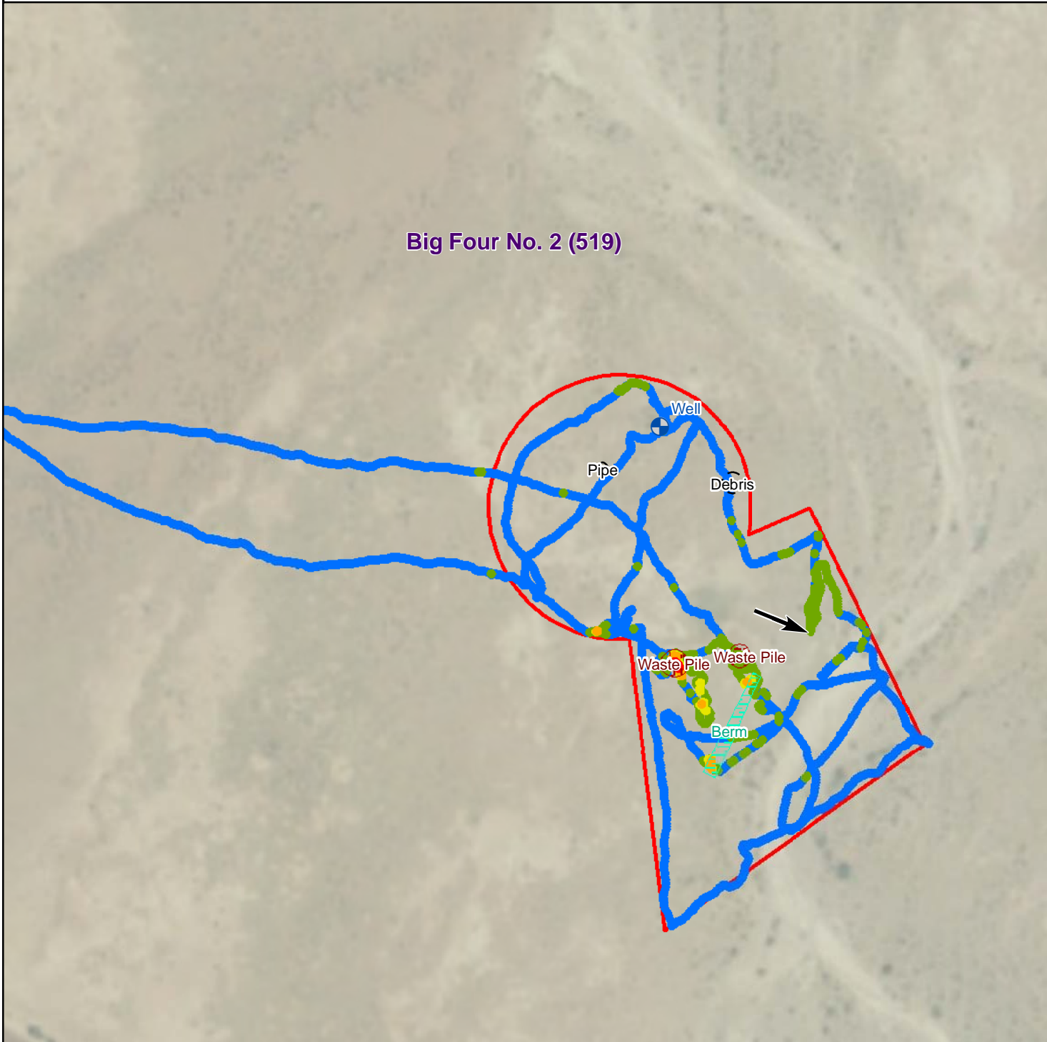
Figure 2 - Gamma Radiation Measurements Big Four No. 2 (519) Ojato Chapter, Navajo Nation