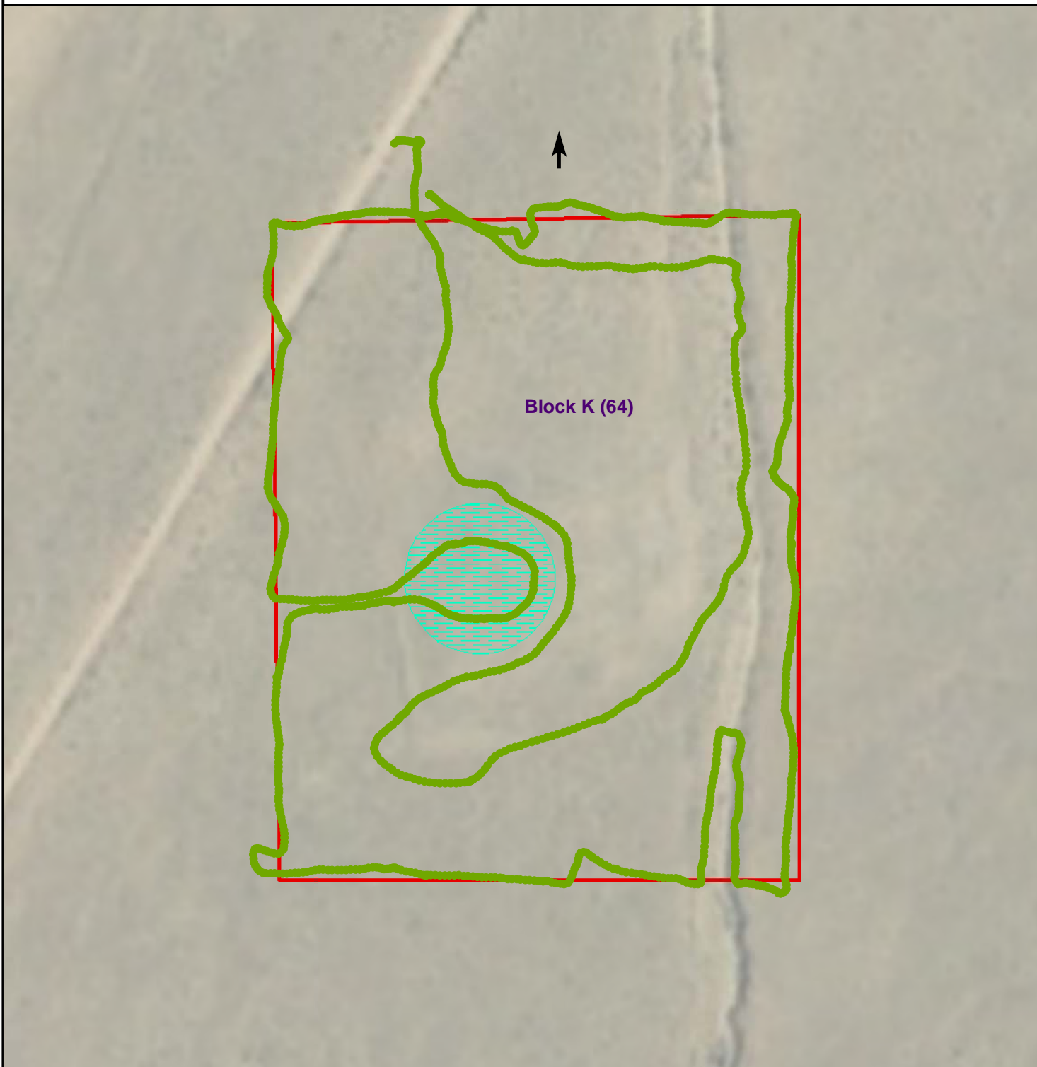
Figure 1 - Gamma Radiation Measurements, Above Two Times Background Block K (64) Teec Nos Pos Chapter, Navajo Nation