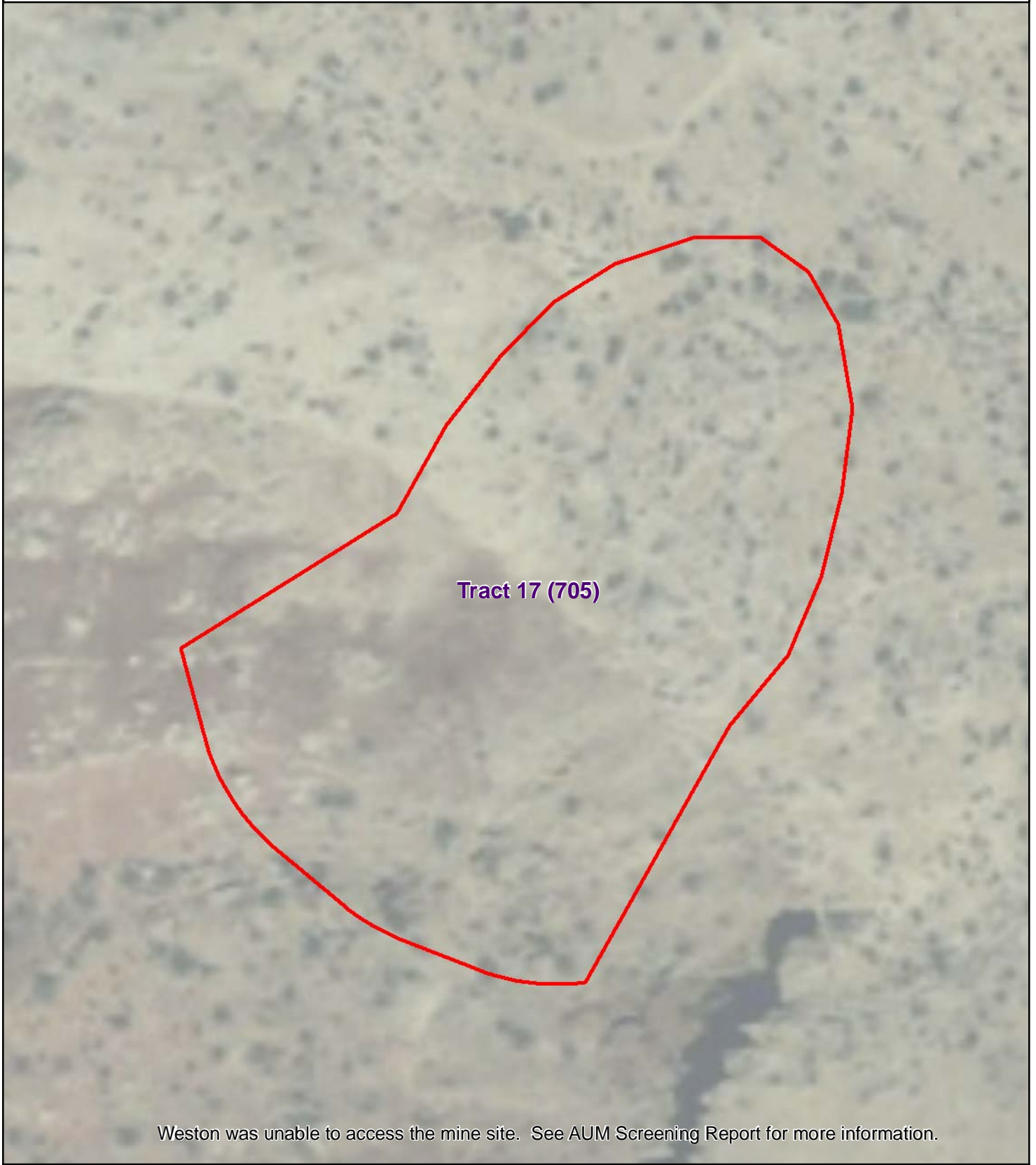
Figure 1 - Inaccessible Tract 17 (705) Oljato Chapter, Navajo Nation

Weston was unable to access the mine site. See AUM Screening Report for more information.