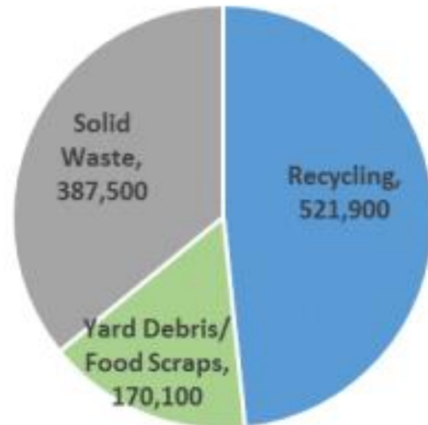
Tons Collected 2015