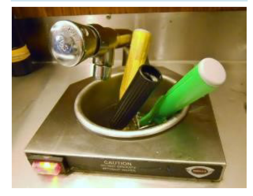
Ecova's equipment audit identified dipper wells as having the greatest potential for water savings.