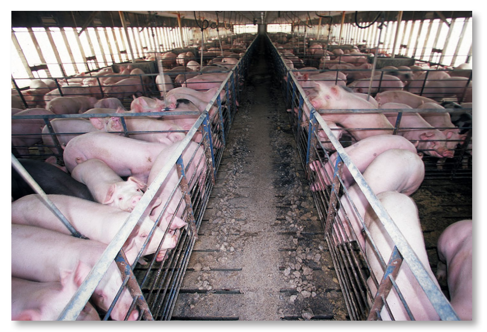
Hog farms produced 220 billion pounds of manure in a single year.

It's not just animals, though. Chemicals in pesticides, herbicides, fungicides, and fertilizers can also cause water pollution. Pesticides, herbicides, and fungicides are used to kill pests such as crop-eating insects and to control the growth of weeds and fungi. Fertilizers are used to feed crops and make them grow faster and healthier. Unfortunately, chemicals used to kill bugs and weeds can also damage other things. These chemicals can enter and contaminate water in several waysthrough use and overuse in or around the water, from runoff, or by the wind. And their effects can be deadly. The chemicals can kill fish and other wildlife, poison food sources, and destroy the habitat that small animals use to hide from predators.