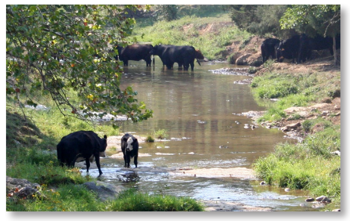
Fencing off natural streams from cattle will reduce sedimentation and nutrient pollution.

In some cases farmers use animal waste as fertilizer, and even though it's natural, if used incorrectly it can do terrible damage to water resources. In fact, it can cause eutrophication, or algae buildup, which depletes the oxygen aquatic organisms need to breathe.