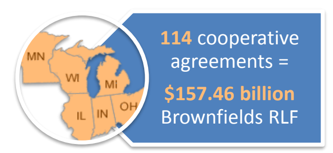
Source: EPA OIG graphic summarizing EPA Region 5 cooperative agreements.

According to OBLR, Region 5 has awarded 114 cooperative agreements for a total of $157,461,967 in the Brownfields RLF Program more than any EPA region. Region 5 has also negotiated over 40 percent of the closeout agreements nationwide.