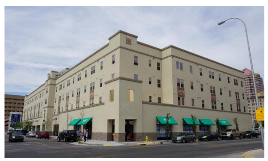
Completed 12,000-square-foot grocery store sits on a former brownfield site in Albuquerque, New Mexico.

The EPA agreed with all three recommendations and provided corrective actions and completion dates. The EPA will develop policies that require (1) any new amendments to cooperative agreements include the term and condition to deposit program income into an interest-bearing account; (2) any new closeout agreements include the term and condition to deposit program income into an interest-bearing account; and (3) all recipients to maintain program income, and requires revolving loan funds to be maintained in interest-bearing accounts. The EPA provided an estimated completion date of March 31, 2018, for the corrective actions. We consider the agency's planned corrective actions to be acceptable.