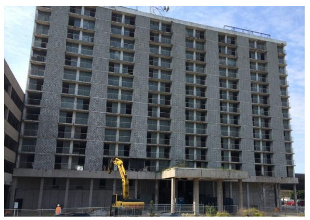
EPA Brownfields grants funded asbestos removal from an abandoned building, clearing the way for its demolition in Gary, Indiana.

When a region applies a different definition to post-closeout loan payments, and does not define those payments as program income, there is no requirement for recipients to spend the funds on Brownfields RLF-related activities. In addition, when post-closeout program income is not used on Brownfields RLF activities, recovered funds cannot revolve, and the essence of the RLF program is lost.