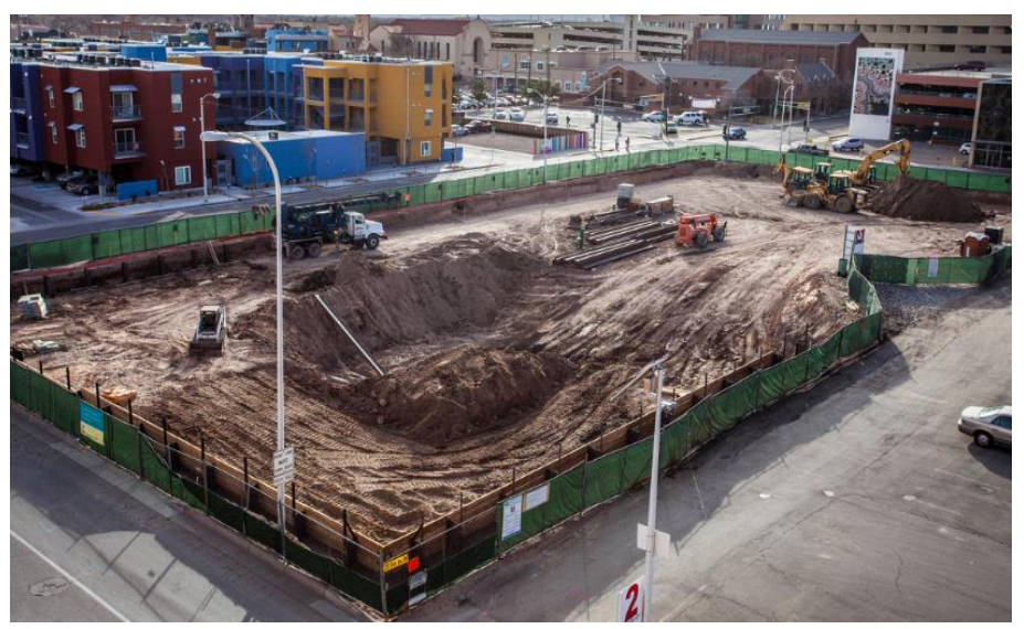
This construction site—a former brownfield site in Albuquerque, New Mexico—later became a 12,000-square-foot grocery store.

In certain circumstance where the recipient has both remaining EPA funding and accrued program income, the EPA regions may also want to request an exception from the grant regulation in 40 CFR 31.21 (f)(2). This regulation requires accrued program income to be used prior to drawing down the unobligated balance of RLF cooperative agreement funds.