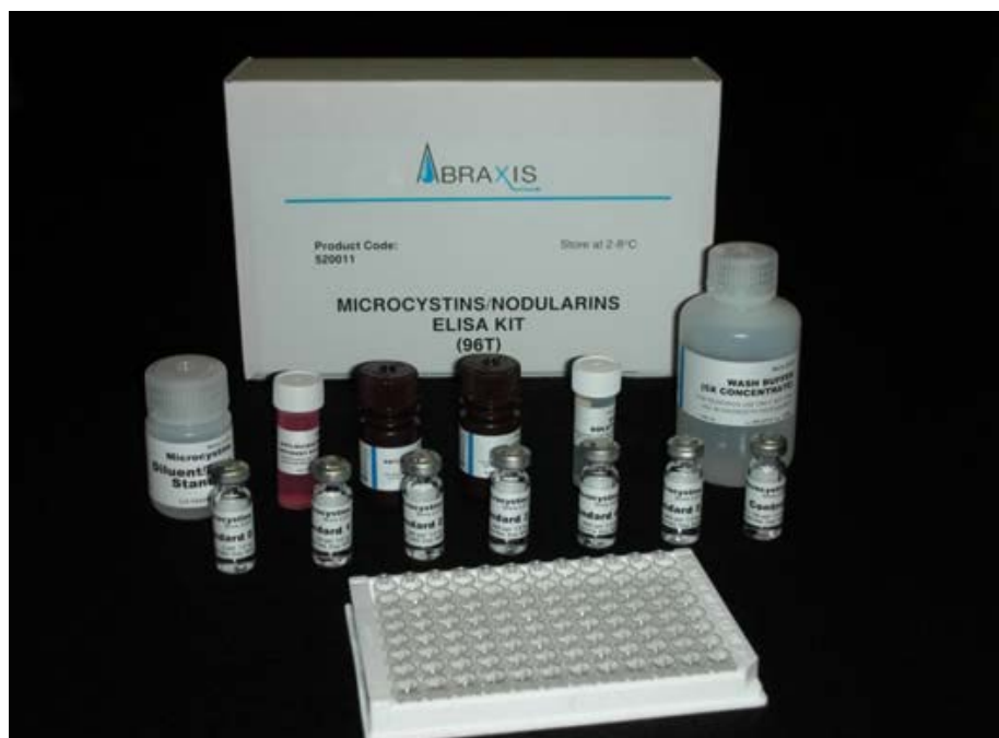
Figure 7-1 Microcystin: Abraxis microcystin test kit (from James, page 3, 2010)

This chapter describes an immunoassay procedure that measures concentrations of total microcystins in water samples. In applying the procedure, the laboratory uses Abraxis' Microcystins-ADDA Test Kits ("kits", Figure 7-1). Each kit is an enzyme-linked immunosorbent assay (ELISA) for the determination of microcystins and nodularins in water samples. Microcystins refers to the entire group of toxins, all of the different congeners, rather than just one congener. Algae can produce one or many different congeners at any one time, including Microcystin-LR (used in the kit's calibration standards), Microcystin-LA, and Microcystin-RR. The different letters on the end signify the chemical structure (each one is slightly different) which makes each congener different.