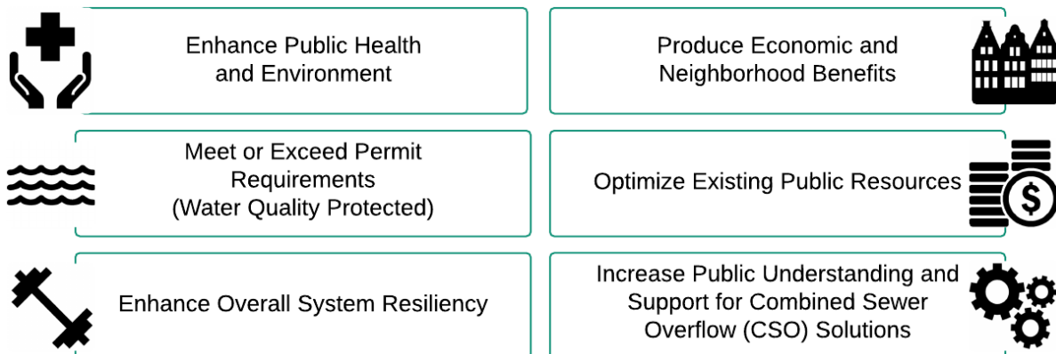
Figure 1: Camden’s LTCP Goals

The Camden Stormwater Management and Resource Training (“SMART”) Initiative is a community-driven movement to protect human health, improve conditions for economic development, improve water quality, and enhance the quality of life for Camden residents. The partnership includes six community organizations including local and state governments, community non-profits, and academic organizations. Importantly, the initiative focuses on the use of both green and gray infrastructure techniques for stormwater management.