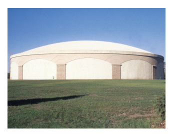
Mitigation by Specific Asset