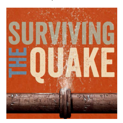
Introduction and Video