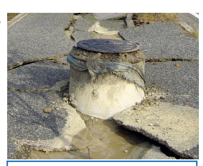
Manhole floats from liquefaction