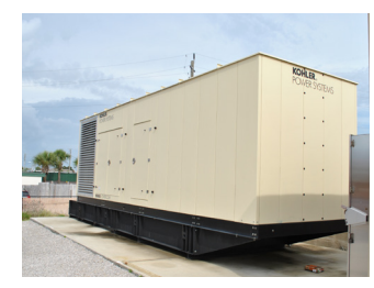
Power Supply and Electrical Components