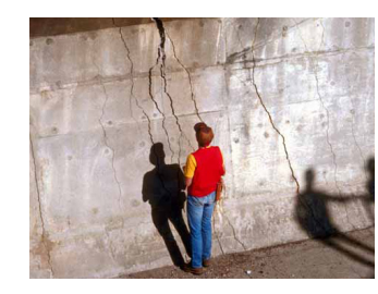
Wells, Source Water and Dams