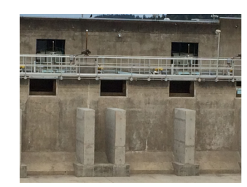
Basins, Reservoirs and Impoundments