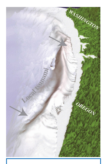
Computer modeling of a tsunami after a hypothetical magnitude 7.8 earthquake on the Cascadia subduction zone.

Fires. Outbreaks of fires often accompany earthquakes. This presents a potential challenge when fires are near utility assets as well as an added responsibility of the utility to maintain water availability for firefighting.