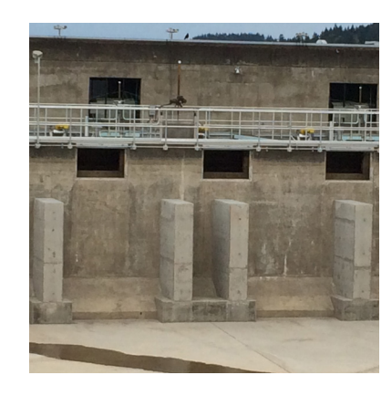
Step 3. Pursue Mitigation and Funding Options