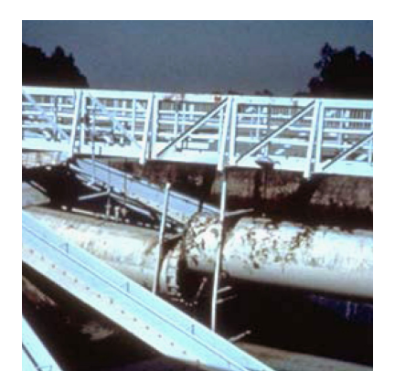
Step 2. Identify Vulnerable Assets and Determine Consequences