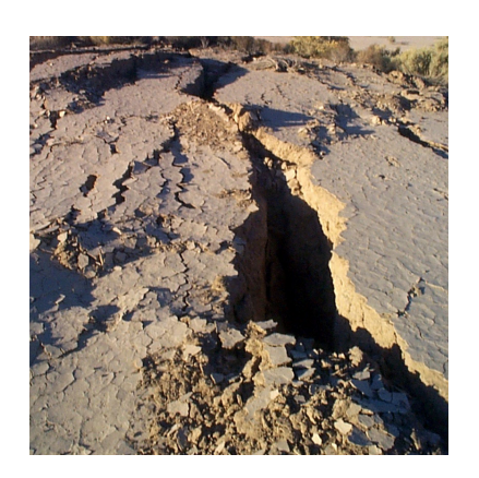
Step 1. Understand the Earthquake Threat