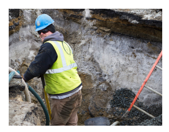
Mitigation through Emergency Response