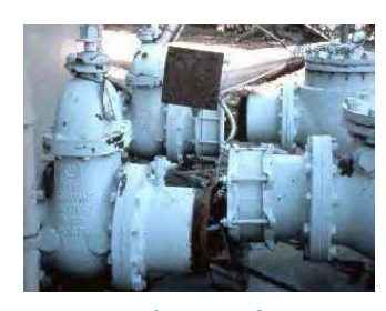
Mitigation for Key Systems in Hazard Areas