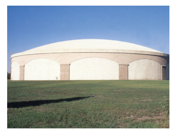
Above Ground Storage Tanks