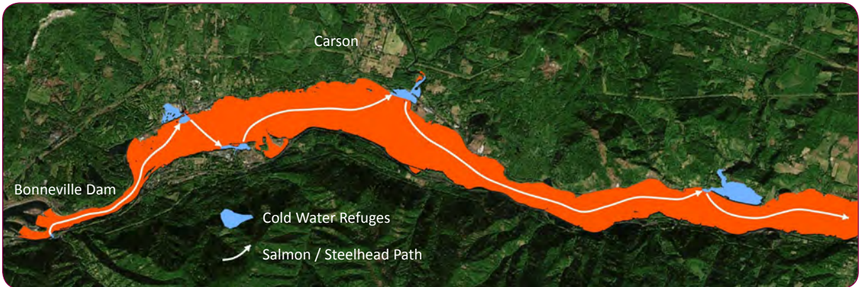
Illustration of potential cold water refuges along the Columbia River Migration Corridor

future. The project area is from the mouth of the Columbia River to its confluence with the Snake River. EPA plans to issue a Columbia River Cold Water Refuges Plan by November 2018. To learn more about cold water refuges and this project, check out EPA's Columbia River Cold Water Refuges website.