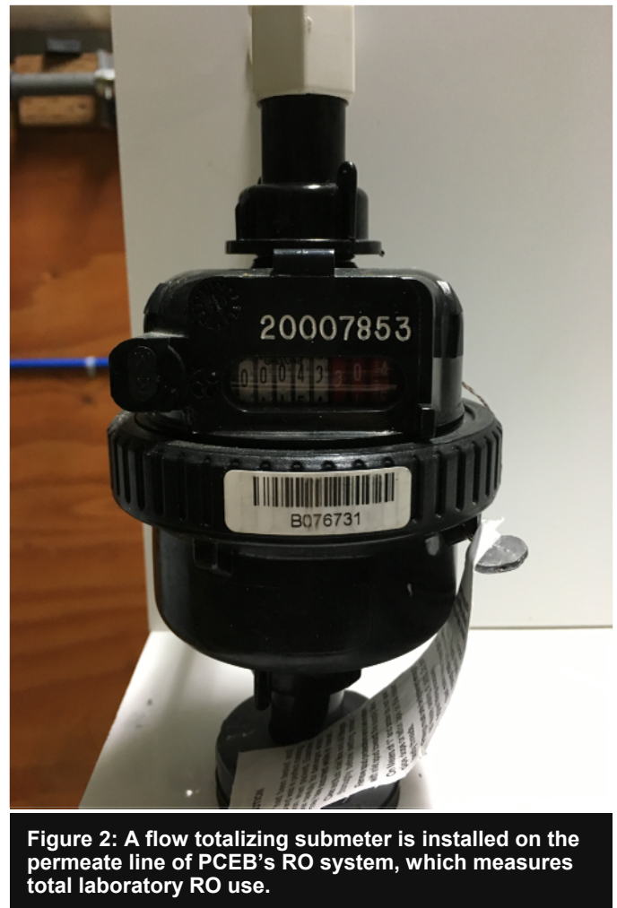
Figure 2: A flow totalizing submeter is installed on the permeate line of PCEB's RO system, which measures total laboratory RO use.

In response to EO 13693 and the executive orders that preceded it, PCEB established an FY 2007 water use intensity baseline of 9.21 gallons per gsf based on 358,000 gallons of water used that fiscal year. In FY 2015, water use intensity was reduced to 4.27 gallons per gsf, or 166,000 gallons of water—a decrease of 54 percent compared to the FY 2007 baseline. Figure 3 provides a graph of PCEB's water use from FY 2007 through FY 2015.