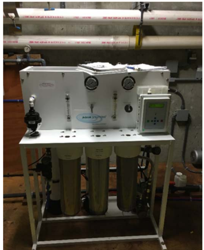
Figure 6. Reject water from PCEB's RO system is pumped to the facility's rainwater collection system for other uses.

Table 3 provides an inventory of sanitary fixtures.