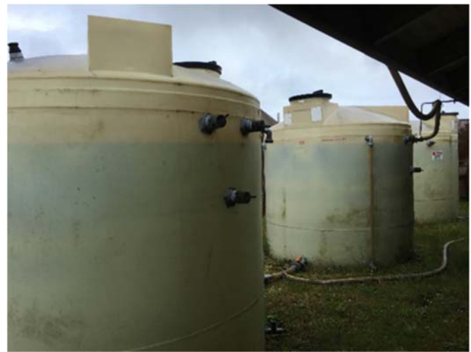
Figure 8. Three 2,500-gallon cisterns collect rainwater and RO reject to use for boat and equipment washing.

The City of Newport has not imposed mandatory water restrictions in recent years. The City of Newport does not have an official water conservation plan that specifically addresses drought, but the Oregon Water Resources Department (WRD) coordinates with municipalities to implement water conservation and curtailment plans when drought emergencies are declared.