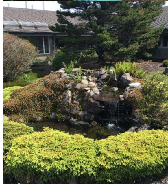
Figure 7: Rainwater collected in the inner courtyard could be used to refill the water feature.