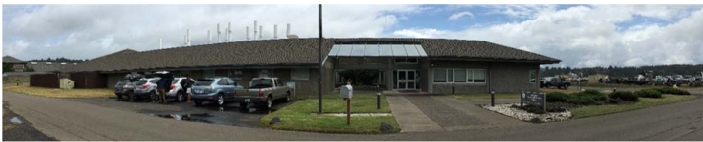
Figure 1: Panoramic view of PCEB laboratory in Newport, Oregon.

The Energy Independence and Security Act (EISA) of 2007 directs agencies to complete comprehensive energy and water evaluations for 25 percent of covered facilities (i.e., those accounting for 75 percent of total agency energy use) each year, resulting in each covered facility being assessed once every four years. It also directs agencies to implement cost-effective measures identified through life-cycle analyses and measure and verify water savings.