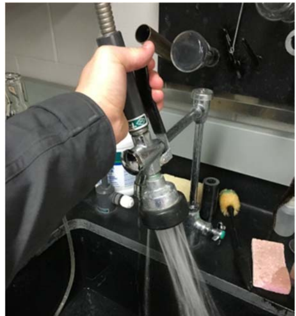
Figure 5: PCEB could replace two PRSVs flowing at 3.3 gpm with WaterSense labeled models to reduce facility water use.

The two PRSVs and the glassware washer are located in Room S115. The glassware washer is a Napco NLW-400 laboratory glassware washer, which was installed recently to replace an outdated model. PCEB also used to have two autoclaves, but they were removed due to lack of use. The two PRSVs had a measured flow rate of 3.3 gpm each. Laboratory staff indicated these spray valves are used mostly in the summer months, when more field activity is conducted. To reduce facility water use, PCEB will consider replacing these PRSVs with WaterSense labeled models, which flow at 1.28 gpm or less.