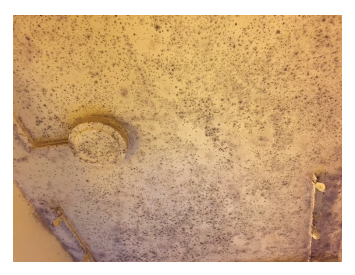
170. Nor the mold recorded in this NYCHA unit: