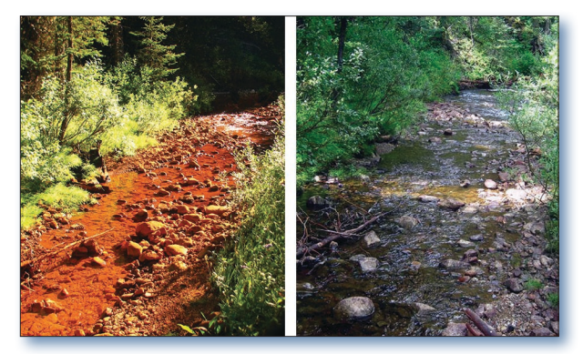
Figure 2. Soda Butte Creek before (left) and after (right) restoration.

impoundment. The 10-acre impoundment, which held approximately 0.5 million tons of mine tailings and 1 million gallons of contaminated groundwater, was underlain by a sand and gravel aquifer. Dewatering the tailings required intercepting uncontaminated groundwater around the perimeter of the tailings and pumping contaminated water from the under the impoundment. The pumped contaminated tailings water was sent to a temporary water treatment plant. More than 110 million gallons of water were treated with calcium hydroxide during active reclamation to increase pH and precipitate dissolved metals. Excavated tailings were amended with quicklime to dry the tailings for placement in the mine waste repository and neutralize the acidity of the tailings. About 1,800 feet of stream channels along Soda Butte Creek and Miller Creek were reconstructed in their approximate pre-mining locations in 2013. The project site was covered with compost-amended soil and seeded in 2014.