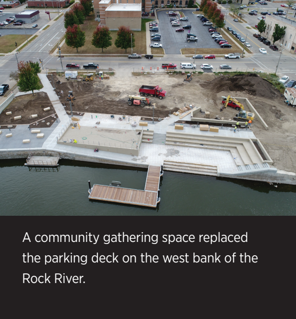
A community gathering space replaced the parking deck on the west bank of the Rock River.

“ The ARISE Plan, made possible only with EPA funding assistance, allowed the community to establish a common vision for downtown revitalization and pursue its implementation vigorously. It was the right tool at the right time. ”