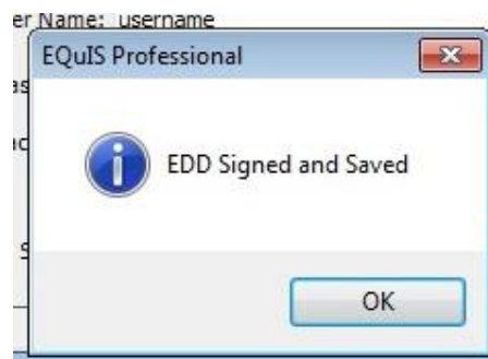
Figure 15: saved the EDD file

5. Select Save. Once the zipped EDD Package has been saved the following screen will appear.