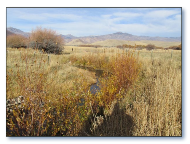
Figure 3. Main Creek in 2017, after restoration.

As a result of the project implementation, notable improvements have been observed within the Main Creek watershed. These improvements include significant loading reductions of E. coli and nutrients. The amount of fine sediment in the creek has decreased and the vegetative cover has increased. The channel width has narrowed and pool depth has increased, leading to decreased water temperatures and a vast improvement in the biological composition in the restored sections. Data show that Main Creek met water quality standards (WQS) for temperature beginning in 2014 (Table 1), prompting Utah to remove it from the 2014 CWA section 303(d) list of impaired