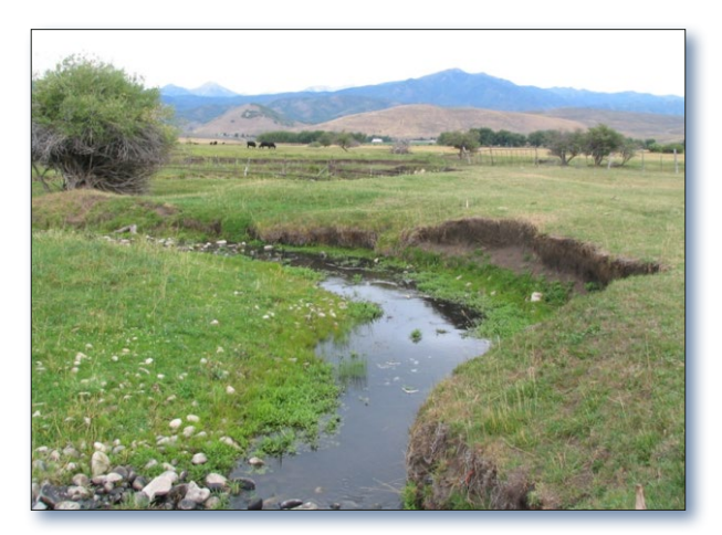
Figure 2. Main Creek in 2013, before restoration.

way to lower water temperature and reduce E. coli and total phosphorus loading to Main Creek and Deer Creek Reservoir. Streambanks are characterized as highly erodible due to lack of riparian vegetation and access by livestock. The lack of native woody vegetation along the creek also allowed for higher in-stream temperature due to a lack of shading.