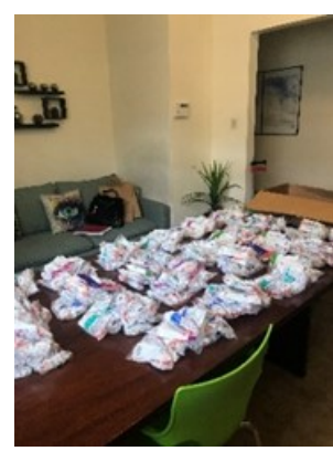
Figure 6: Insulin-related durable goods delivered to Puerto Rico.

To accomplish this, the EJ IWG worked with several partners, including EPA, USDA, FWS, Insulin for Life, Pediatrics Foundation of Puerto Rico, Medical Center of San Juan, Vieques House of Representatives, and medical practitioners in the United States and Puerto Rico. As a result of this public and private sector collaboration, the EJ IWG secured and transported insulin-related durable goods from Florida to Puerto Rico. Eleven distribution points were in overburdened and vulnerable communities across the island, including three pediatric foundations, and supplies were divided among doctors to help distribute the medical supplies for free, as needed. These efforts in Puerto Rico are ongoing, and the EJ IWG plans to expand the network of partners to leverage more resources to help vulnerable communities affected by natural disasters address their health concerns.