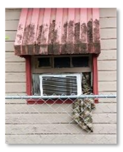
Figure 1: A home in Union Height (neighborhood in North Charleston) using a blanket as insulation.

In FY 2019, the EJ IWG Goods Movement Committee<sup>8</sup> partnered with EPA Region 4 and the Lowcountry Alliance for Model Communities<sup>9</sup> (LAMC) to host a working session and community resource fair to help the North Charleston community develop an actionable implementation plan. The goal of the plan was to improve community resilience and share key tools and resources with community members. Federal and state agencies shared resources related to the community's environment, health, housing, transportation, and economic opportunities. The EJ IWG NEPA Committee discussed the EJ IWG's Community Guide to Environmental Justice and NEPA Methods as well as the EJ IWG Promising Practices for EJ Methodologies in NEPA Reviews. The following tools were also shared: U.S. DOE's Weatherization Assistance Program; U.S. DOE's Clean Energy for Low Income Communities Accelerator; U.S. DOT's Safe Routes to Schools Activities; and U.S. EPA's College/Underserved Community Partnership Program.