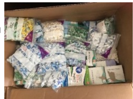
Figure 5: Insulin-related durable goods delivered to Puerto Rico.

The EJ IWG expanded its place-based disaster preparedness and response model to help vulnerable communities after Hurricanes Florence and Michael (discussed above) to include Puerto Rico in FY 2019. The EJ IWG's Rural Communities Committee (RCC) piloted a project to help communities in Puerto Rico manage chronic diabetes after the occurrence of a natural disaster. In the last several years, Puerto Rico has experienced several major hurricanes that have devastated the environment and left people with chronic diabetes especially vulnerable. Diabetes is a contributor of morbidity and mortality during natural disasters, especially for vulnerable populations. Knowing that medical supplies were needed for those with chronic diabetes, the RCC launched an effort to find out how to connect vulnerable populations with diabetes to the medical supplies that they needed.