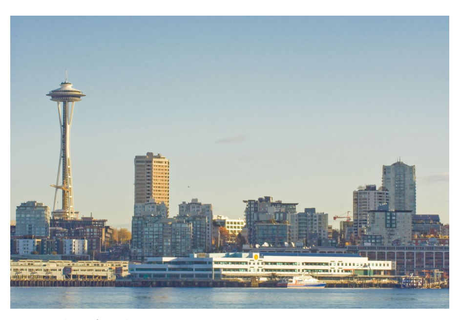
Figure 2: Photo of Seattle.

In FY 2019, EPA Region 10 assisted with developing, planning, and participating in the two training events with input from several Seattle community leaders. The first part was a 90-minute presentation, Primer on the National Environmental Policy Act and Environmental Justice. It introduced community members to NEPA, environmental justice and the EJ IWG. The second part was a 3-hour Workshop on Promising Practices for EJ Methodologies in NEPA Reviews. The training included an interactive hypothetical transportation infrastructure project to help participants explore how these two EJ IWG resources - <a href="Promising Practices for EJ Methodologies in NEPA Reviews">Promising Practices for EJ Methodologies in NEPA Reviews</a> and <a href="Community Guide to Environmental Justice and NEPA Methods">Community Guide to Environmental Justice and NEPA Methods</a> - can support the consideration of EJ during various stages of the NEPA process. Development and planning efforts occurred throughout FY 2019 while the trainings took place in early FY 2020.