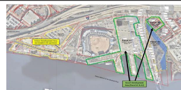
Brownfield Community Meeting for EPA Area-Wide Planning Grant | May 2019

The creation of a resort casino in the Harbor Park Area will provide a variety of amenities. Anticipated development includes a hotel, numerous restaurants, a spa, entertainment venues, and other features. Pending the outcome of the referendum, with the City of Norfolk swiftly moving forward toward the development of a casino, anticipated construction will begin in 2021 with the casino resort to open in 2022.