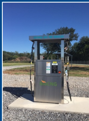
CNG pump at the St. Landry site 8