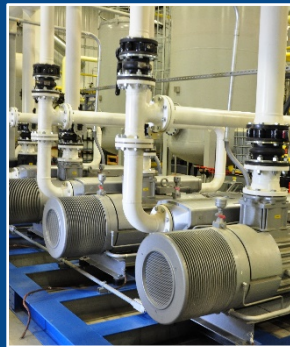
RNG production facility at the SWACO landfill 7