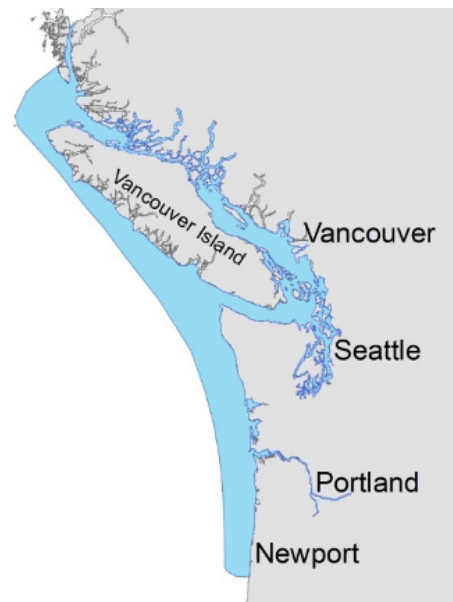
Salish Sea Model Domain (from website)

While the SSM is geographically specific, there are similar hydrodynamic models in other waterways. Using them for studies like this help us all determine where to focus our efforts. For more information on the Salish Sea Model, visit https://salish-sea.pnnl.gov/SSM/projects/marine-pollution/microplastic-transport.stm .