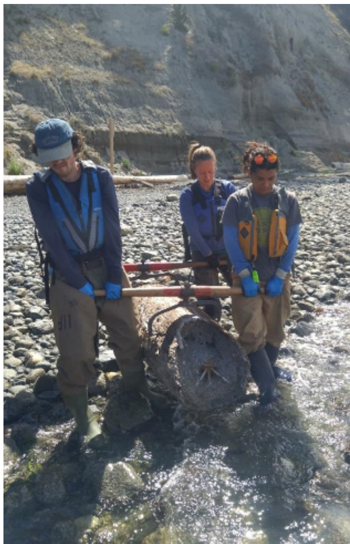
A creosote piling being removed from Lopez Island, WA.

The Samish DNR and its partners plan to continue their cleanup efforts this summer. Restoring the Samish Territory ensures the protection of the Samish People's cultural identity which is deeply connected to the Salish Sea coastal environment. Check out the Creosote Marine Debris Data Summary Report Story Map here: https://storymaps.arcgis.com/stories/907423ba45d84895b769db1dbd061502