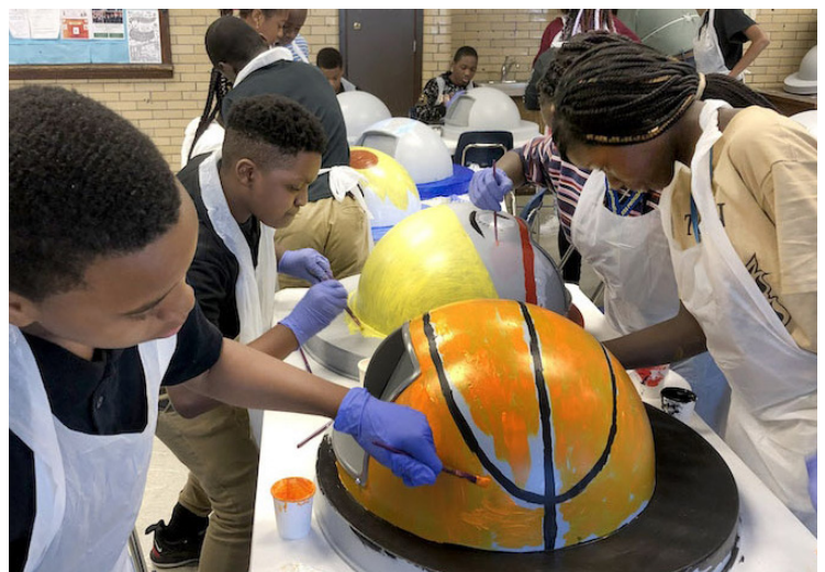
Tiden Middle School students painting can lids for Southwest Philly.