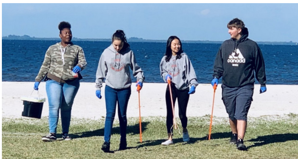
Volunteers at the CHNEP cleanup event

The Coastal & Heartland National Estuary Partnership (CHNEP) held a ‘Trash Tackle’ on Saturday, February 29 th , in partnership with Keep Charlotte Beautiful and to celebrate #EmbraceTheGulf2020 and Great American Cleanup month. CHNEP staff educated the 33 volunteers about single use plastics and microplastics. Volunteers and staff then picked up marine debris out of the mangroves and shoreline along Charlotte Harbor in Punta Gorda, FL. This event was part of a monthly volunteer event series that CHNEP offers to educate and equip citizens to protect and restore the natural resources in their own communities.