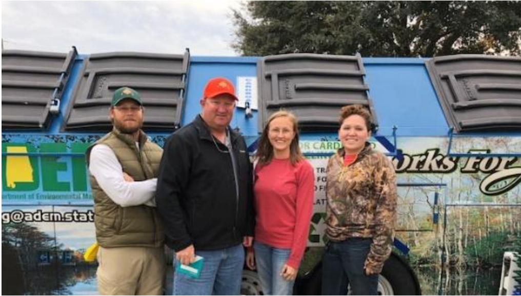
Poarch Band of Creek Indians