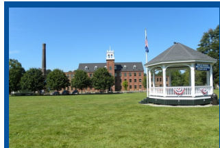
North Berwick Woolen Mill (after)

Thousands of properties have been assessed and cleaned up through the Brownfields Program,