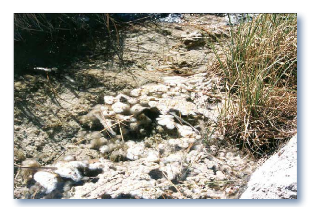
Figure 2. Nuisance algal blooms were common in pools below Sitting Bull Falls in the mid-1990s.

road and parking lot (Figure 3). They installed pipe fencing around the picnic areas to discourage access to the unauthorized trails and to protect the riparian area from erosion. In addition, the partners installed a new water supply well and upgraded the restroom facilities; these improvements have resolved the sanitation issue and reduced bacterial loading. Volunteer site hosts are stationed in RVs onsite to monitor the day-use area to ensure success. This project was a good example of interagency cooperation on resource management, as both agencies came together on their planning efforts to upgrade the recreation area and improve water quality.