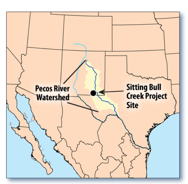
Figure 1. Sitting Bull Creek is in the Pecos River watershed in New Mexico.

Staff from the NMED Surface Water Quality Bureau (SWQB) identified the probable sources of Sitting Bull Creek's water quality problems as dispersed recreation, improper sanitation, grazing and roads. The key pollution sources were addressed before a TMDL could be developed.