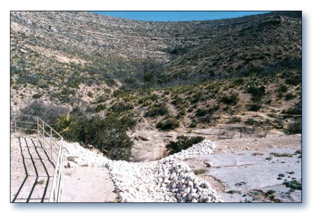
Figure 3. Restoration project efforts included adding fencing and armoring drainage ditches.

In July 2006, NMED SWQB performed a nutrient assessment that showed acceptable levels for the ecoregion-specific ratios required for nitrogen and phosphorus. Chlorophyll a and pH levels also fell within acceptable ranges. Because three or more indicators fell within acceptable ranges, the segment is considered not impaired by nutrients and qualifies as providing full support of its designated uses. As a result, the NMED SWQB removed