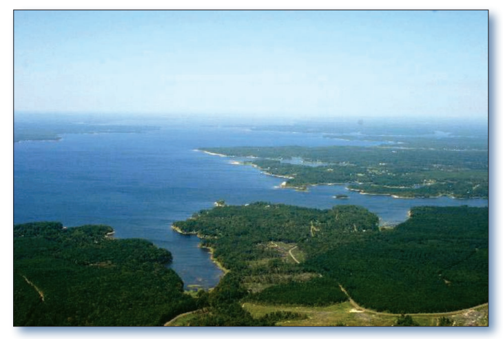
The Tenaha Creek Arm of the Toledo Bend Reservoir is in Shelby County, Texas.

Toledo Bend Reservoir is designated for high aquatic life use in freshwater. To meet the state's water quality standards for this designated use, Toledo Bend Reservoir must maintain a 24-hour average DO concentration above 5.0 milligrams per liter (mg/L), and a 24-hour minimum sample concentration above 3.0 mg/L. The Tenaha Creek Arm of Toledo Bend Reservoir (segment 0504 _ 06) first appeared on the state's CWA section 303(d) list of impaired waters in 2000 for not meeting the standard for DO.