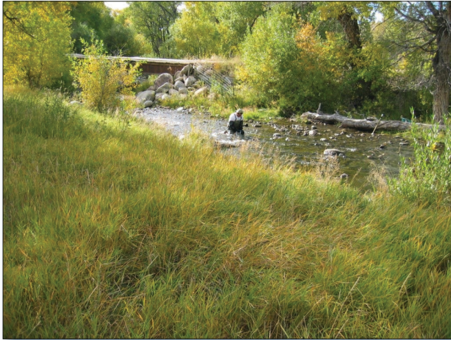
Figure 2. A staff member collects water quality data at a riffle monitoring site on North Fork Crazy Woman Creek.

habitat degraded with distance downstream. WDEQ placed a 28-mile segment of NFCWC (segment WYPR100902050100_01) on the 1996 CWA section 303(d) list of impaired and threatened waters due to threats to aquatic life uses from habitat degradation and nutrient enrichment.