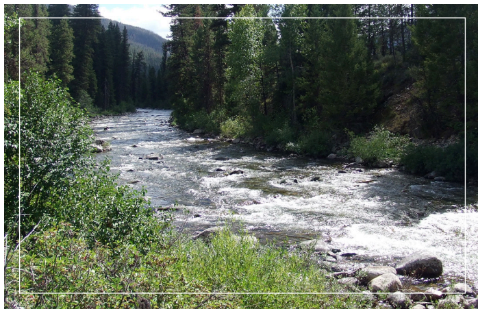
JOHNSON CREEK IN VALLEY COUNTY, IDAHO, A TRIBUTARY OF THE SALMON RIVER.