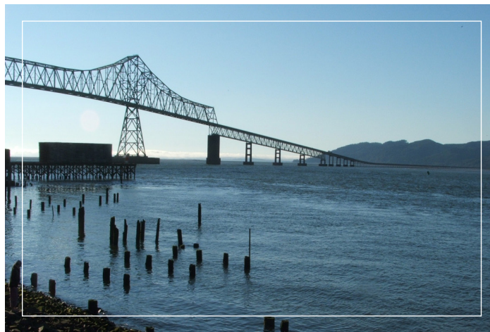
THE ASTORIA-MEGLER BRIDGE NEAR THE MOUTH OF THE COLUMBIA RIVER.

The City of Vancouver Public Works Department will lead a study to conduct water quality sampling at six locations within the Columbia Slope sub-watershed. The sampling will expand the city's