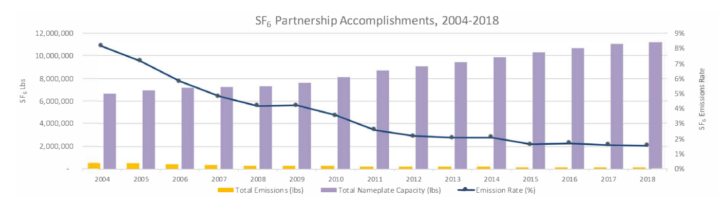
Figure 3. SF<sub>6</sub> Emissions and Emission Rate for Partners of the SF<sub>6</sub> Emission Reduction Partnership for Electric Power Systems

These innovative technologies and approaches are expected to further reduce or eliminate SF_6 emissions. In many cases, Partners of EPA's SF_6 Emission Reduction Partnership for Electric Power Systems have reduced SF_6 emissions to a very low emission rate—the average Partnership emission rate currently hovers below 2%.