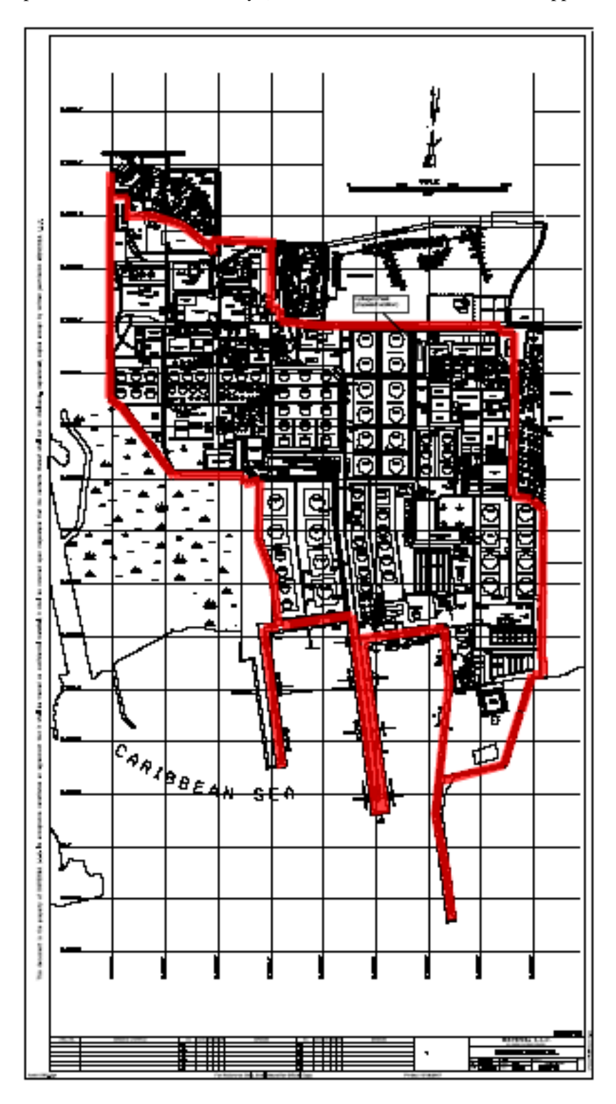
Figure 1. Plot plan of HOVENSA Refinery