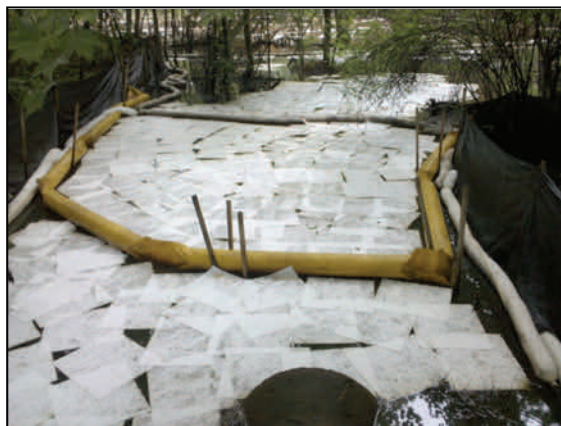
Spill response to diesel fuel release.