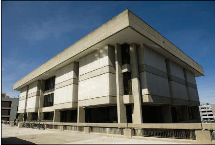
Virginia Technology's Cowgill Hall