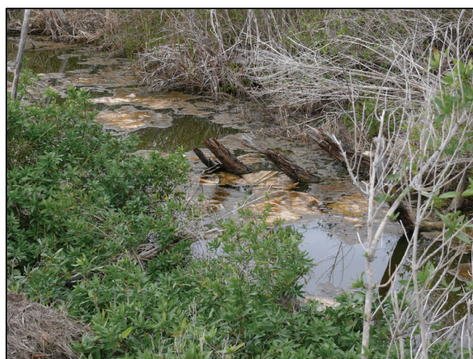
Oil contaminated waters of the State