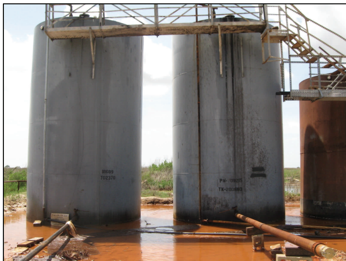
Oil pooled around T & F storage tanks