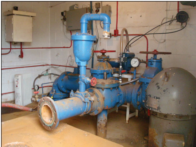
The pump that the Village of Crestwood used to draw water from an underground aquifer, which was used to supplement their drinking water drawn from Lake Michigan. This picture was taken after the pump was already disconnected from the well and taken out of service.