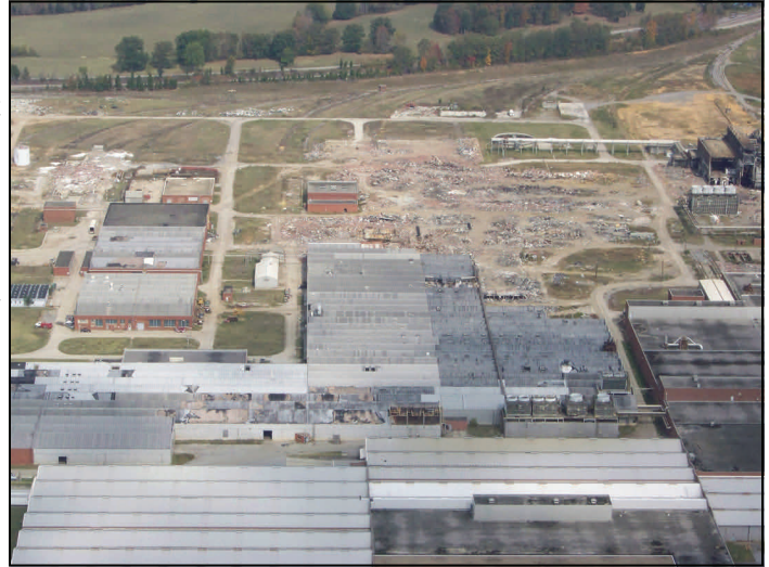
Aerial photo of the former Liberty Fibers Plant