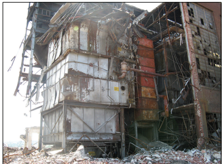
Stripped boiler from powerhouse of the facility