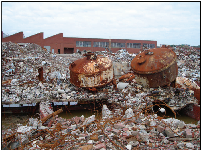
Debris piles with stripped tanks