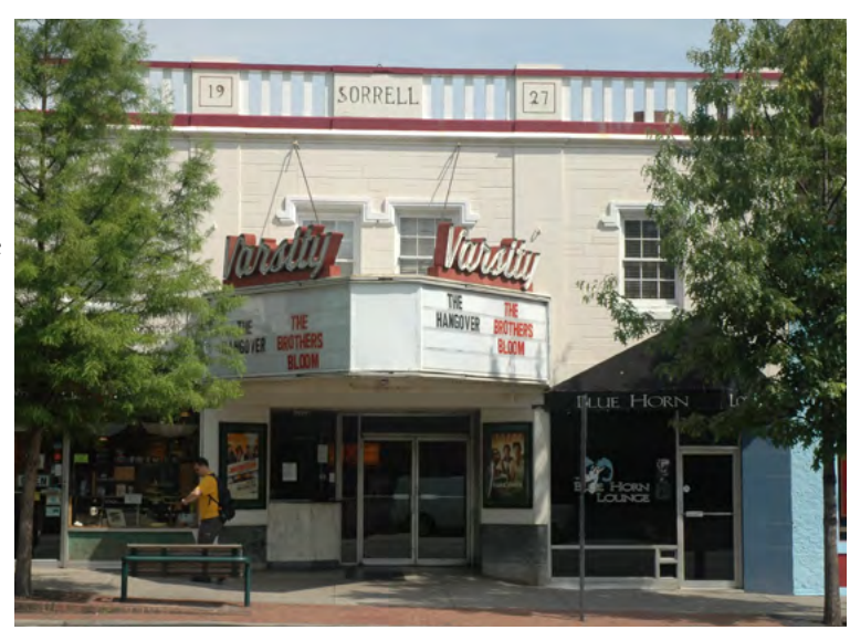
Chapel Hill, North Carolina

oversee assessment and cleanup activities at the majority of brownfield sites across the country. This noncompetitive grant program can support the development of a response program's regulations or procedures, the purchase of environmental insurance, the capitalization of a Revolving Loan Fund for brownfields cleanup, and other activities. Funding goes directly to states and tribes. Depending on state and tribal priorities, communities may be able to access some of the funding for their own environmental insurance, technical assistance, or other capital needs.