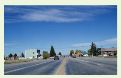
Victor, Idaho before improvements

The City of Victor found a way to begin implementing these concepts with minimal funding. They worked with the Idaho Transportation Department to add bike lanes and diagonal parking spaces, narrowing travel lanes, calming traffic, and increasing transportation options for residents and customers of local businesses. This simple investment set the stage for attracting the downtown activity that residents want and demonstrated to developers that revitalization is a priority for the City. Through its Envision Victor effort, the community is exploring other ways of implementing the options presented by the technical assistance.