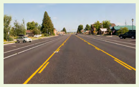
Victor, Idaho after improvements, courtesy of City of Victor