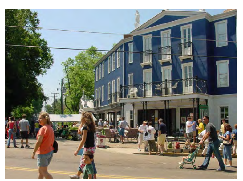
Starkville, Mississippi, courtesy of EPA

The Local Climate and Energy Program helps local governments meet multiple environmental and economic goals with cost-effective climate change mitigation and clean energy strategies. EPA provides local governments with peer exchange training opportunities along with planning,