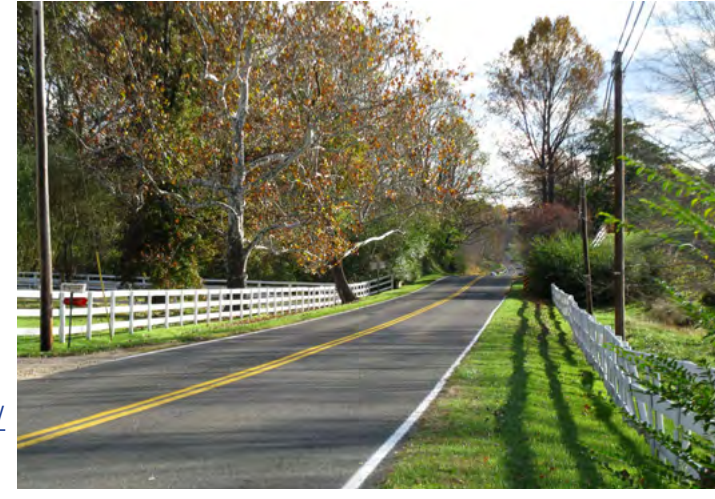
Virginia, courtesy of EPA

www.fhwa.dot.gov/federalaid/guide/guide current.cfm#c78