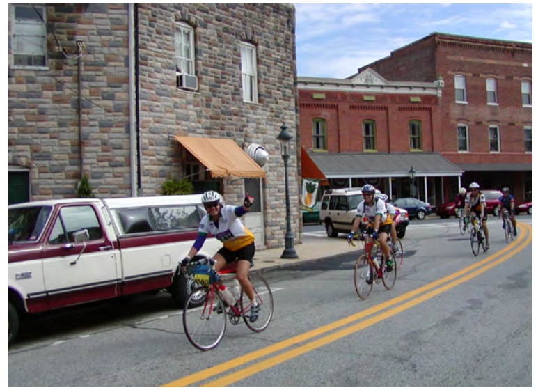
Berlin, Maryland, courtesy of Worcester County

www.fhwa.dot.gov/environment/recreational trails/index.cfm