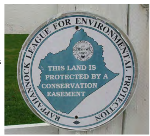
Rappahannock County, Virginia, courtesy of EPA

www.nrcs.usda.gov/wps/portal/nrcs/main/ national/programs/financial/csp