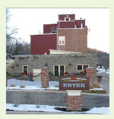
Potosi Brewery

Southwestern Wisconsin regional and local leaders are combining multiple federal funding sources to strengthen the economy, create jobs, and capitalize on assets such as the strong agricultural sector. Through Project Produce, funded by a USDA Rural Business Opportunity Grant, they are exploring the feasibility of scaling up fruit and vegetable production on existing family farms and creating tools to help growers explore new markets in the region. This project was born out of a five county planning effort, Grow Southwest Wisconsin, which is funded by a HUD Sustainable Communities Regional Planning Grant and dedicated to making the area a place that the coming generations will want to live in. Several catalytic projects have also been implemented in the region. For instance, state brownfields funding, Scenic Byways funding, and a USDA Business & Industry Guaranteed Loan were used to revitalize the Potosi Brewery, a historic brewery along the Mississippi River that now provides jobs and serves as a tourist destination and local amenity.