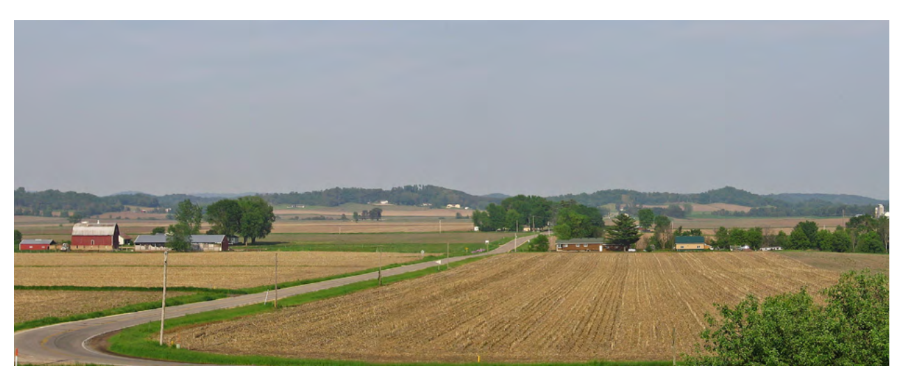
Galesville, Wisconsin

• The Rental Assistance Program provides rental assistance to households with incomes too low to pay the Housing and Community Facilities Program subsidized rent.