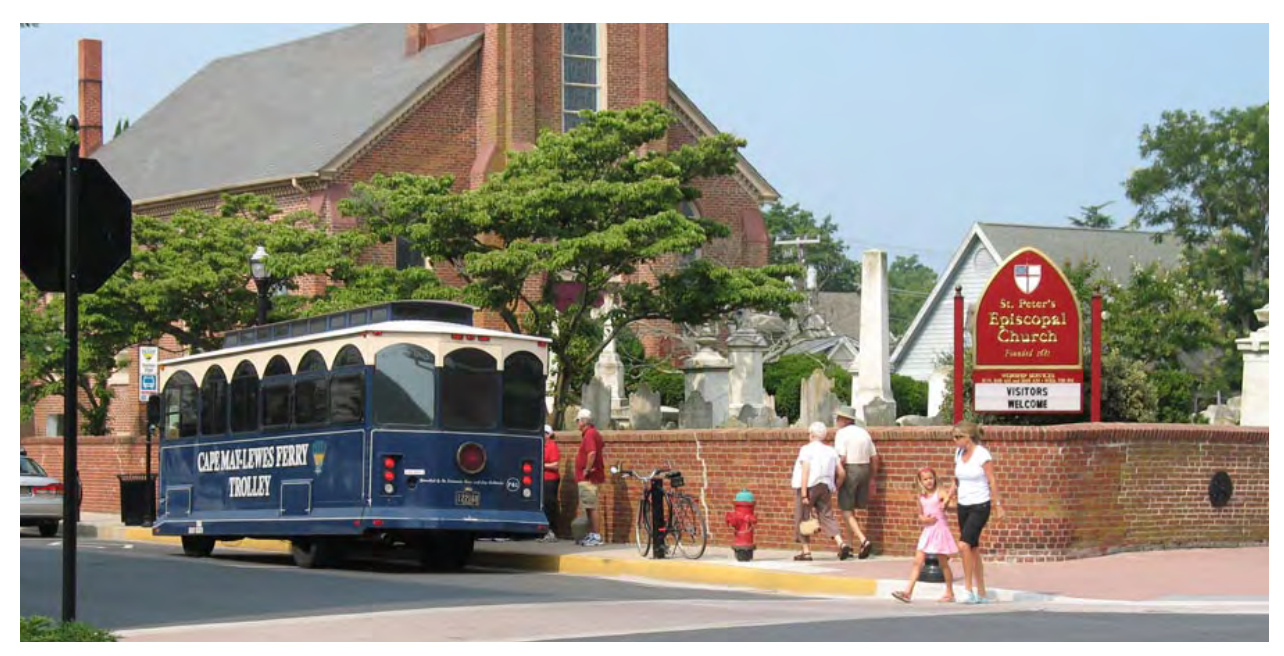
Lewes, Delaware, courtesy of EPA

Easter Seals Project ACTION (Accessible Community Transportation in Our Nation) is a national technical assistance project to encourage and facilitate cooperation between the disability and transportation communities, with the goal of achieving universal access to transportation for persons with disabilities nationwide. This project is funded through a cooperative agreement with FTA.