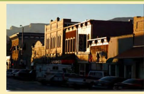
Rifle, Colorado

The Colorado Department of Local Affairs received a TIGER II Planning Grant and a HUD Community Challenge Grant to help three small communities—Fowler, Monte Vista, and Rifle—pursue a unique joint planning initiative to revitalize their downtowns. The work will include creating construction-ready design drawings for the renovation of historic buildings and planning for development that will increase walkability, transportation choice, and energy efficiency.