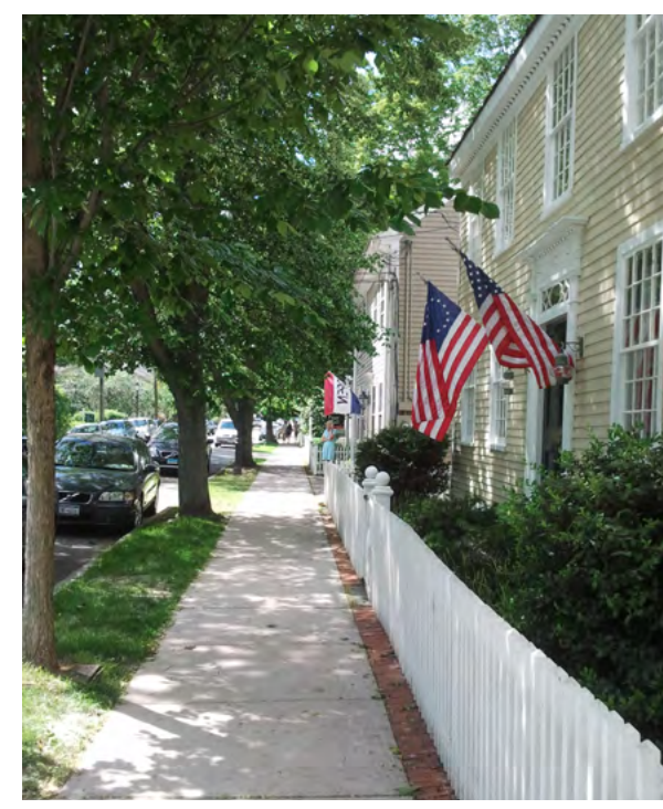
Essex, Connecticut, courtesy of EPA

are flexible funding tools that address a wide range of community and economic development needs, including decent housing, healthy living environments, and expanded economic opportunity. Funds are allocated by a set formula directly to "entitlement communities," areas comprised of central cities of Metropolitan Statistical Areas, metropolitan cities with populations of at least 50,000, and qualified urban counties with populations of 200,000 or more (excluding the populations of entitlement cities). States typically distribute CDBG funds to rural counties (those with populations less than 200,000, excluding the populations of entitlement cities) and other areas not qualified as entitlement communities through a competitive process. Grant activities must benefit lowand moderate-income persons, aid in the prevention or elimination of slum and blight, or meet urgent community development needs.