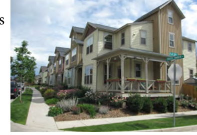
Edwards, Colorado

portal.hud.gov/hudportal/HUD?src=/federal housing administration/healthcare facilities/section 232/lean processing page