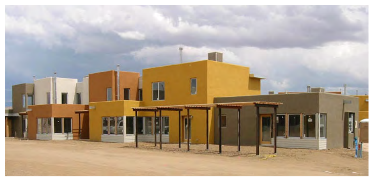
Tsigo Bugeh Village, New Mexico, courtesy of Ohkay Owingeh Housing Authority