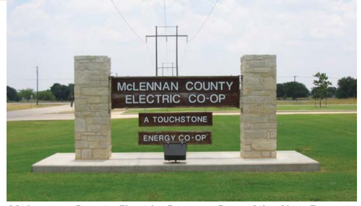
McLennan County Electric Co-op – One of the New Tenants at the McGregor Industrial Park

The former Naval Weapons Industrial Reserve Plant (NWIRP McGregor) comprised 9,700 acres between Dallas and Austin in McGregor, Texas. During its 50-year lifespan, the former NWIRP McGregor facility served the U.S. Army, followed by the U.S. Air Force, and finally the U.S. Navy under several names. From 1942 until its closure in 1995, its mission included the research, testing and manufacture of weapons and solid-fuel rocket propulsion systems.