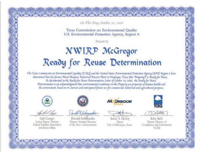
The Navy's First Ready for Reuse Determination

With effective remedies in place, all 9,700 acres of the facility have been transferred to the City of McGregor for redevelopment. The property proved attractive to prospective tenants due to the existing infrastructure and buildings from the military uses, and its proximity to major cities, a regional airport, and onsite rail service. Incentives offered by the city also helped to attract tenants quickly. Tenants at the new McGregor Industrial Park, including Dell Computer Corporation, Ferguson Plumbing Company, General Micrographics, In Situ Forms, SpaceX, and McLennan County Electrical Cooperative, have helped to generate 1,000 new jobs and have invested over $3 million. A new indoor arena was also constructed and is now a regular regional attraction - bringing over 40,000 people to the McGregor area for events.