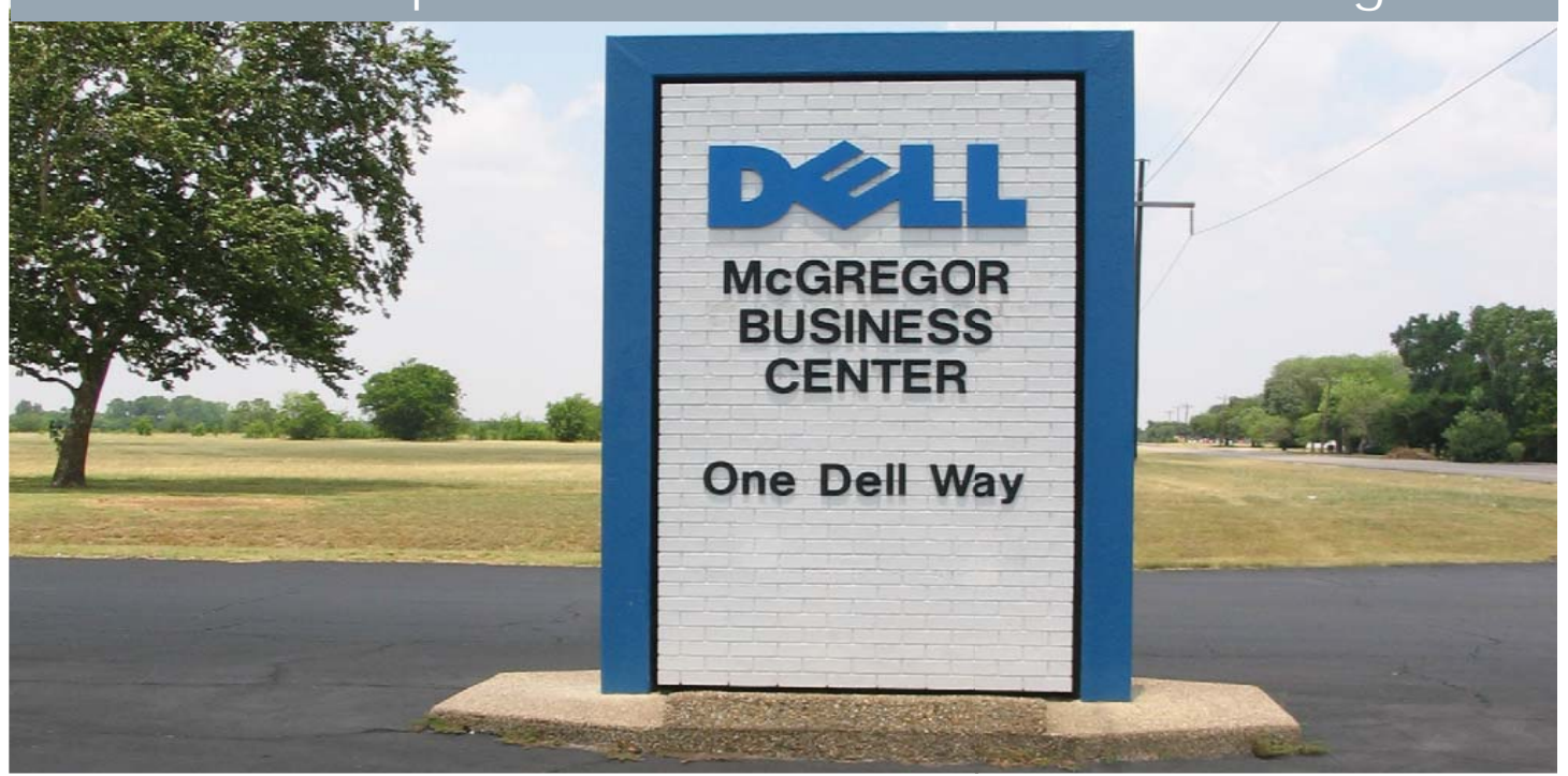
Dell McGregor Business Center

Naval Weapons Industrial Reserve Plant - McGregor