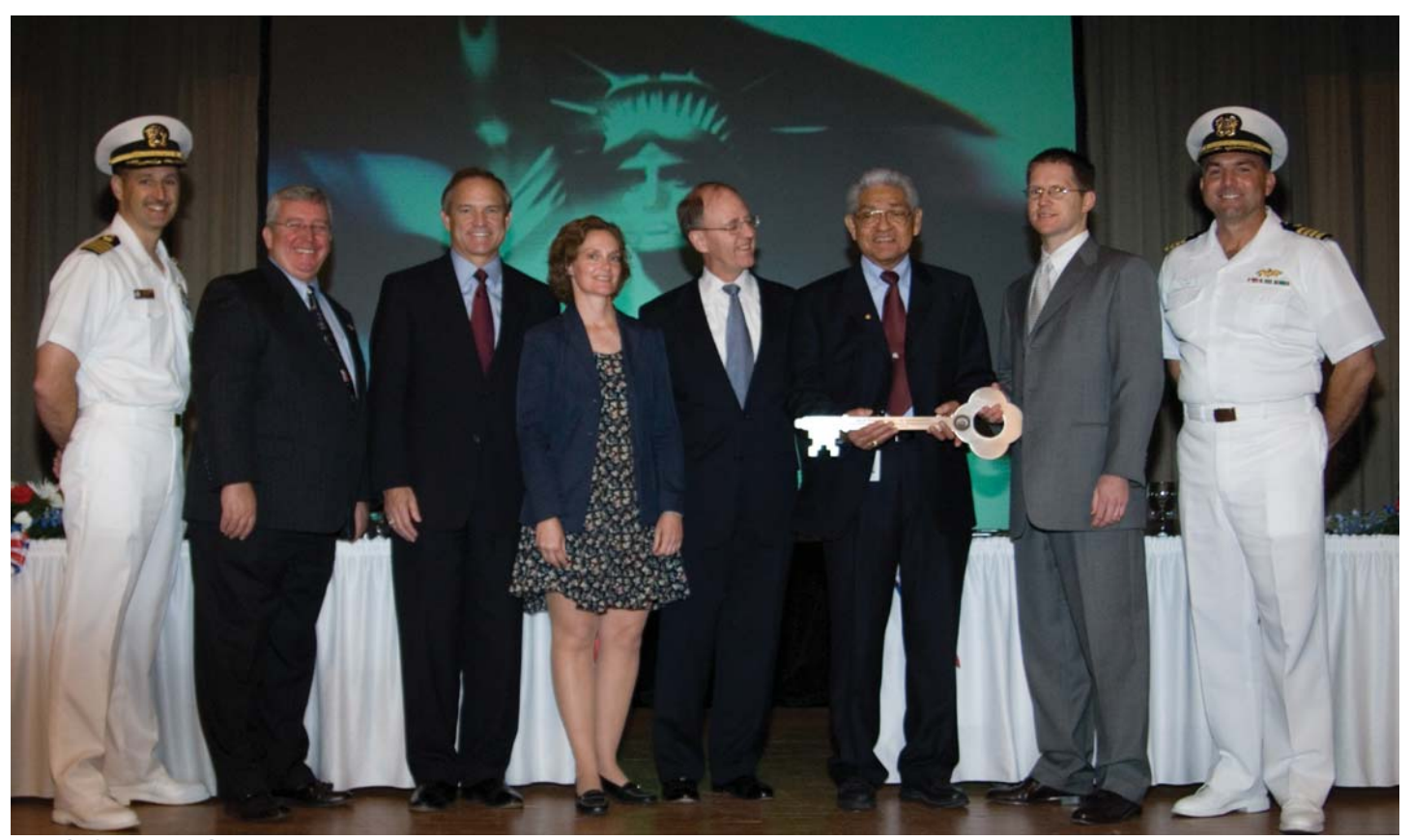
Ready for Reuse Ceremony

The Navy worked with the City of McGregor throughout the environmental investigation and remediation process. A Restoration Advisory Board (RAB) was convened in 1996 to provide a forum for community members, local and state agencies, environmental legislators, and the Navy to discuss and review remediation plans and environmental concerns. The Navy's commitment to partnership and innovative technology resulted in the expedited transfer of property for reuse and a cost-savings of over $20 million in construction costs and $3 million annually.