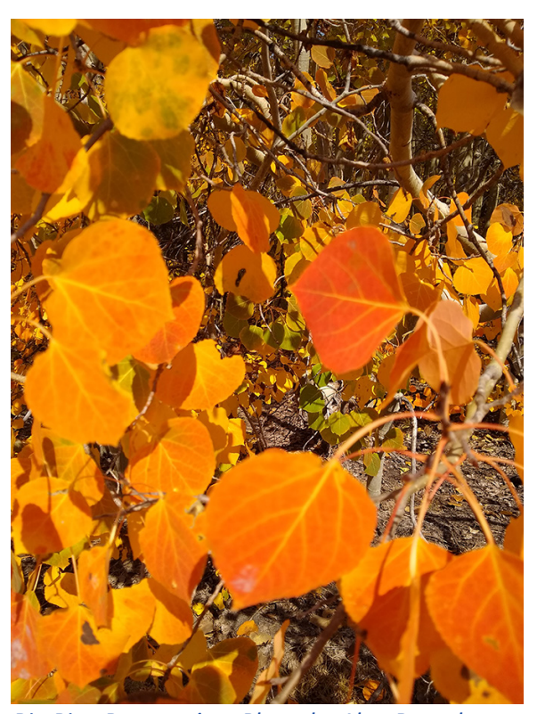
Big Pine Reservation

Please contact Sarvy Mahdavi for further information: 213-244-1830.