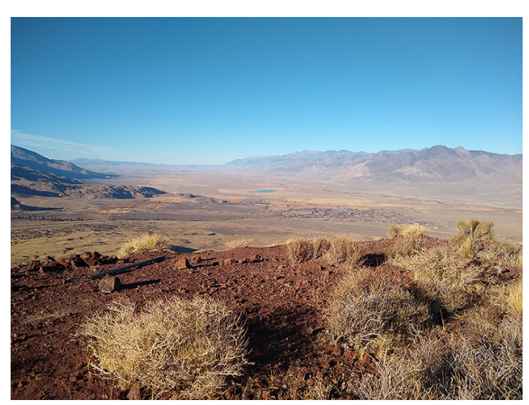
Big Pine Reservation: Photo by Alan Bacock

The first planning period, which began in 2007, focused on Best Available Retrofit Technology at certain sources of pollution. In the first period, the U.S. EPA required states to evaluate each source's individual visibility impacts on Class I Areas.