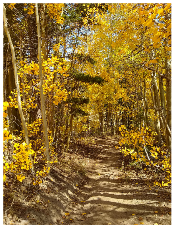
Big Pine Reservation

The Tribal & U.S. EPA Region 9 Annual Conference co-sponsors, the Pala Band of Mission Indians and the U.S. EPA, are pleased to announce that this year's conference theme will be "Tribal Land, Tribal Knowledge, Tribal Sovereignty." The Tribal & U.S. EPA Region 9 Annual Conference brings together more than 300 participants from tribal nations located across Arizona, California, and Nevada; and representatives from federal, state, and local agencies; nonprofits and academia.