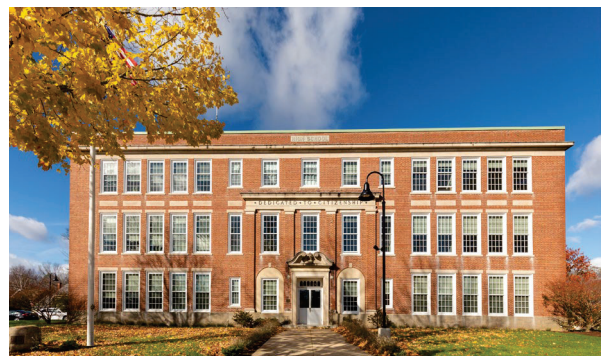
Front entrance for the Hilltop School

The Strafford Regional Planning Commission received an EPA Brownfields community-wide assessment grant in October 2015 and prioritized this site in Somersworth. Their team conducted an environmental site assessment which led to the discovery of minor issues - floor tiles, pipe insulation and other building materials containing asbestos, items with PCBs, and lead paint in the woodwork, all due to age of the building. To encourage the redevelopment, the city sold the property to a private developer and approved a tax incentive for housing and historic preservation. The developer, which specializes in redevelopment of historic properties, including former mills throughout New England, cleaned up the site by abating the asbestos containing materials and the hazardous materials. The redevelopment supported over a hundred construction-related jobs during 2019-2020. EPA's $12,626 investment in grant funds helped spur an almost $4,000,000 investment.