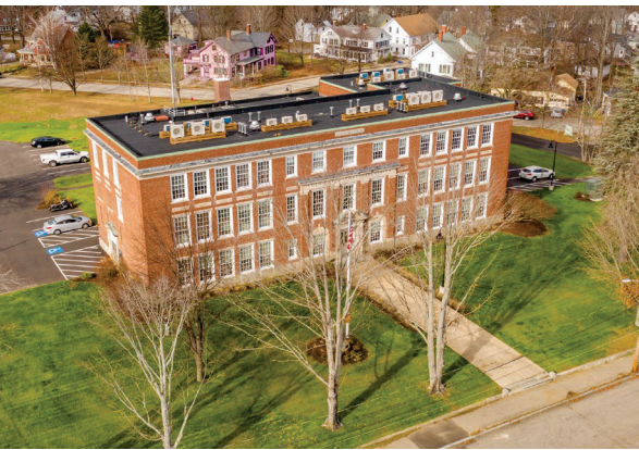
The Hilltop School

“ This a great example of a site where a relatively low-cost assessment was able to answer a few questions and make a much larger private investment possible. This project came at a perfect time for Somersworth and the greater seacoast. We have a housing shortage, and while we've seen more interest in redevelopment lately, this site was ahead of the curve.”