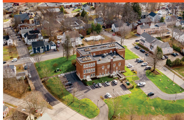
Aerial photo of the Hilltop School