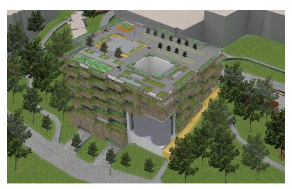
Source: University of Pittsburgh's second place entry in the 2020 Campus RainWorks Challenge.

To sign up for email updates or ask a question about the Campus RainWorks Challenge, please send an email to RainWorks@epa.gov.