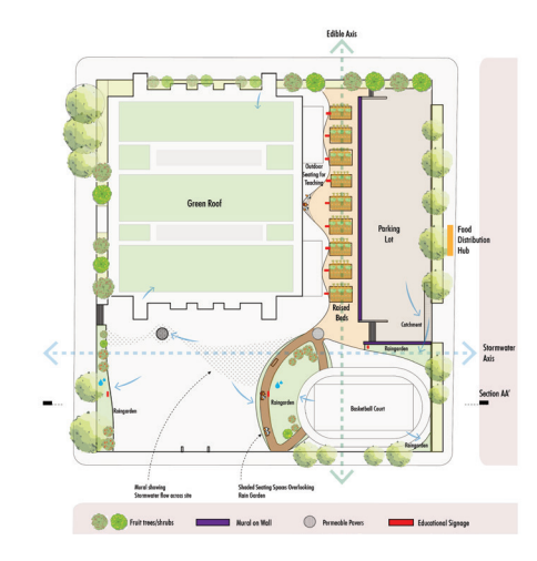
Source: University of Pennsylvania's first place entry in the 2020 Campus RainWorks Challenge.