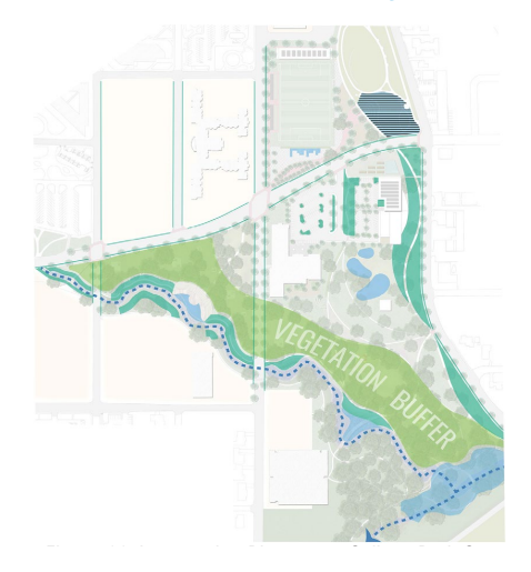
Source: University of Texas at Arlington's first place entry in the 2020 Campus RainWorks Challenge.