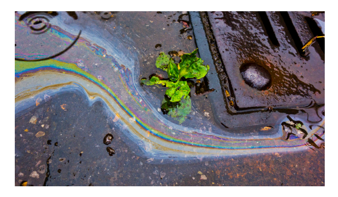
Runoff contaminated with oil and other debris is washed down a storm drain, where it will feed into local waterbodies.

The term "green infrastructure" refers to a variety of practices that restore or mimic natural hydrological processes. While "gray" stormwater infrastructure moves stormwater away from the built environment, green infrastructure uses soils, vegetation, and other media to manage rainwater