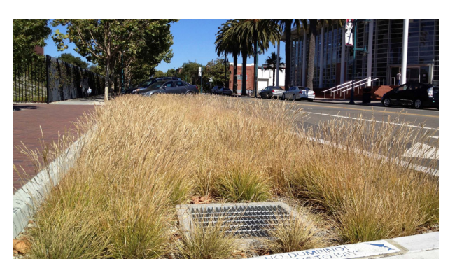
A "green street" uses practices such as porous pavement and bioretention to capture, infiltrate, and evapotranspire stormwater, preventing contaminated runoff from reaching local waterbodies.

where it falls—through capture and evapotranspiration. By integrating natural processes into the built environment, green infrastructure provides a wide variety of community benefits, including improving water and air quality, reducing urban heat island effects, creating habitat for pollinators and other wildlife, and providing aesthetic and recreational value. Green infrastructure solutions can also be cheaper to install and maintain than traditional gray infrastructure.