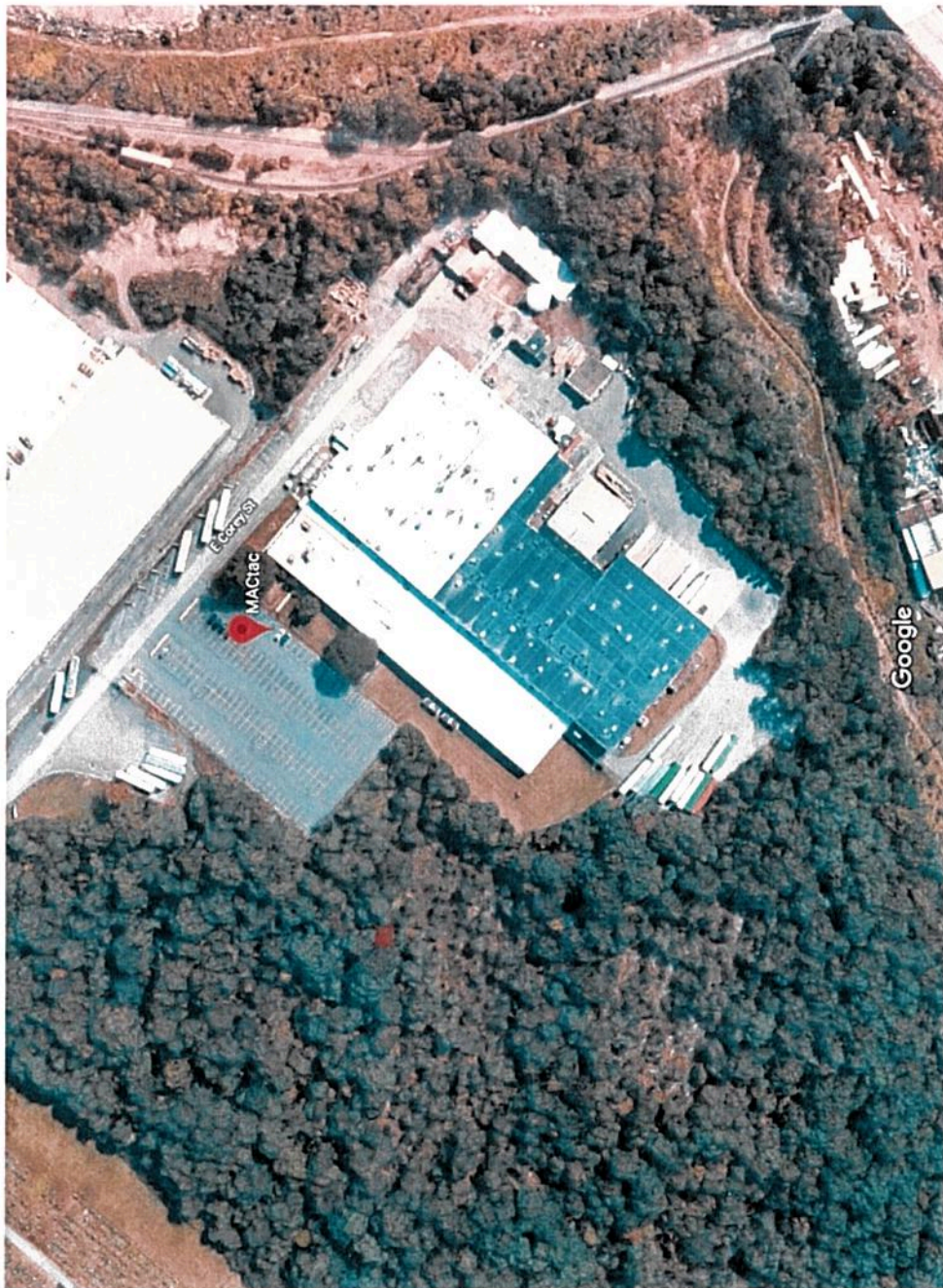
Figure 1: Map of Facility