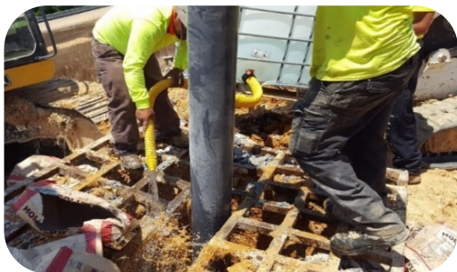
Hydrating bentonite to seal a well