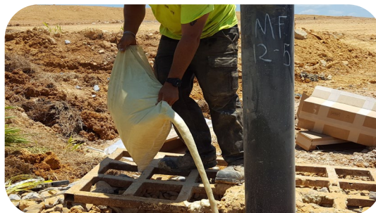
Pouring foam around a well casing