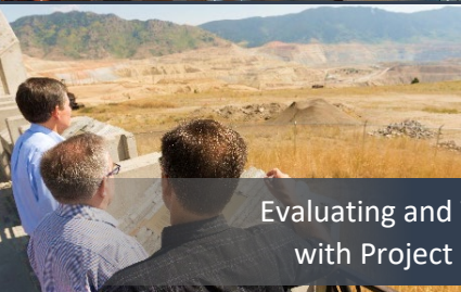
Evaluating and Working with Project Partners