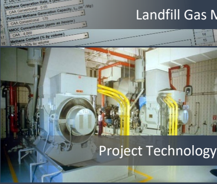
Project Technology Options