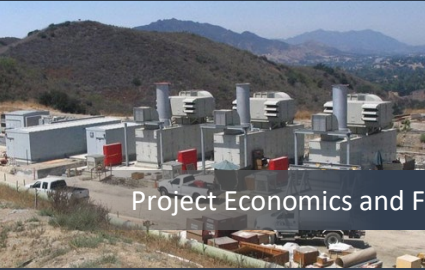
Project Economics and Financing