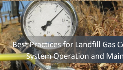
Best Practices for Landfill Gas Collection System Operation and Maintenance