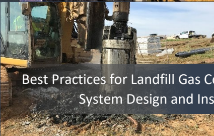
Best Practices for Landfill Gas Collection System Design and Installation