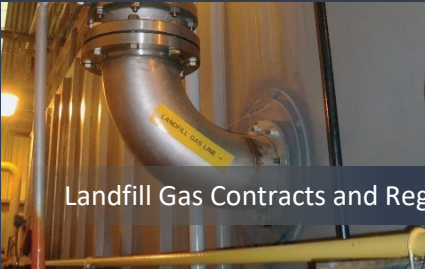
Landfill Gas Contracts and Regulations