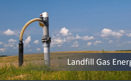
Landfill Gas Energy Basics