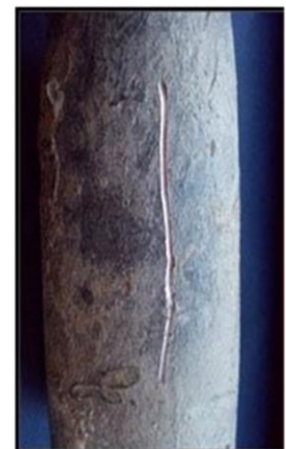
Picture of a Scratch on a Lead Service Line

Don't forget to include kitchen kettles in your sampling plan. Kitchen kettles are large containers of water that are then heated to steam or cook things like vegetables, sauces, pastas, rice, etc. They are used in larger kitchens, like some school kitchens, and sample results taken from these have found to contain elevated lead.