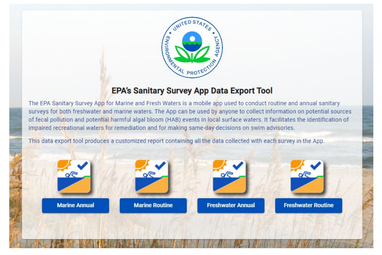
Figure 2. Select survey to download data

5. Click on the title or app icon of any of the surveys shown in Figure 2 to download your data for that survey. You can only download data from one type of survey (marine or freshwater, annual or routine) at a time.