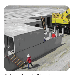
Subsurface infiltration basin in Rancho Mirage, CA.

runoff from rooftops, sidewalks, and streets. Unlike conventional gardens, rain gardens receive most of their water from precipitation. In the arid and semi-arid West, where landscape irrigation accounts for about 40% of municipal water demand, rain gardens can play an important role in both water conservation and stormwater management.