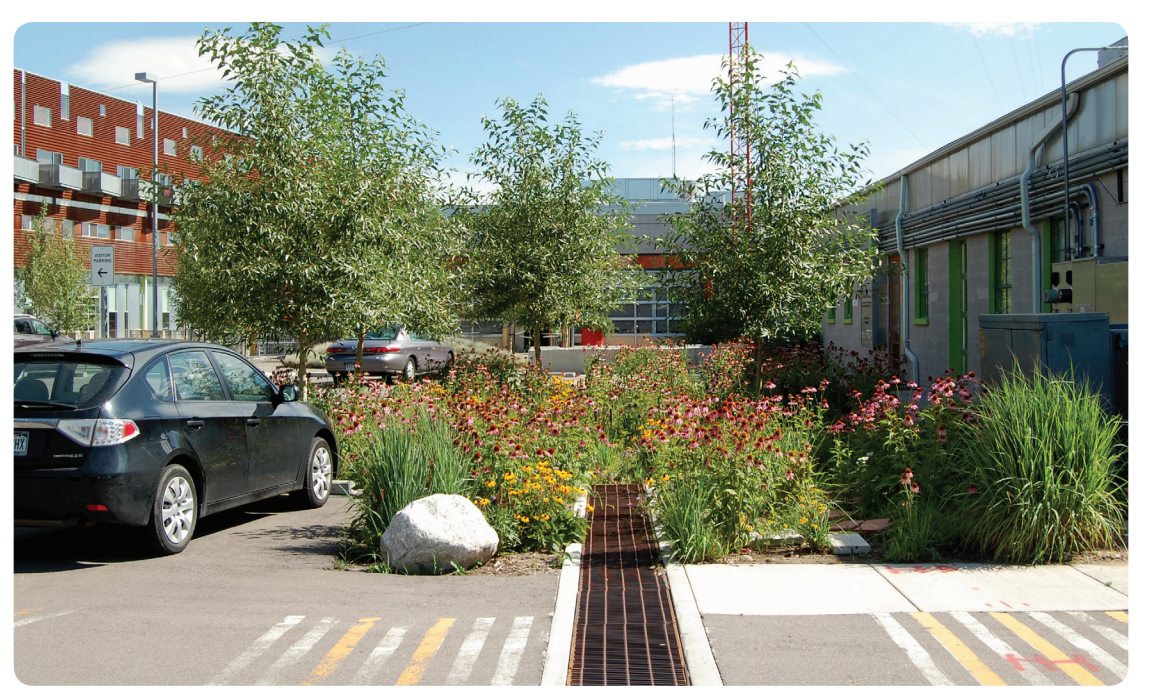
Rain gardens fed by passive rainwater harvesting border the buildings and parking lots of the TAXI redevelopment project in Denver, CO. The rain gardens beautify the site, reduce the urban heat island effect, and provide habitat, while reducing runoff to the nearby South Platte River.

Plant selection for rain gardens: Bear in mind the potential for occasional inundation. Though standing water should last no more than 72 hours, plants located at the lowest elevations should be able to tolerate inundation.