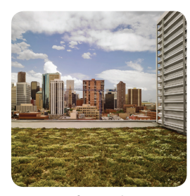
Green roof atop the EPA Region 8 office in Denver, CO.