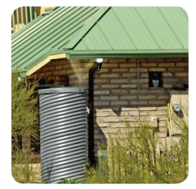
Active rainwater harvesting in Tucson, AZ.