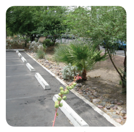
Passive rainwater harvesting in Tucson, AZ.