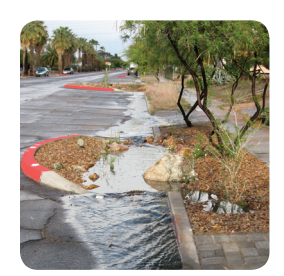
Green street in Tucson, AZ.

tanks can capture most rooftop runoff and supply much of the irrigation demand. A 2007 study prepared for the Colorado Water Conservation Board, for instance, found that a 5,000-gallon cistern paired with waterwise landscaping could provide 50% of the irrigation demand for a 7,000-square-foot lot in Douglas County, CO.<sup>1</sup> The cost of these systems, however, increases significantly with storage volume—particularly for underground storage construction. In sizing rainwater harvesting systems, site owners must balance the multiple benefits of stormwater retention and water conservation against the costs of construction.