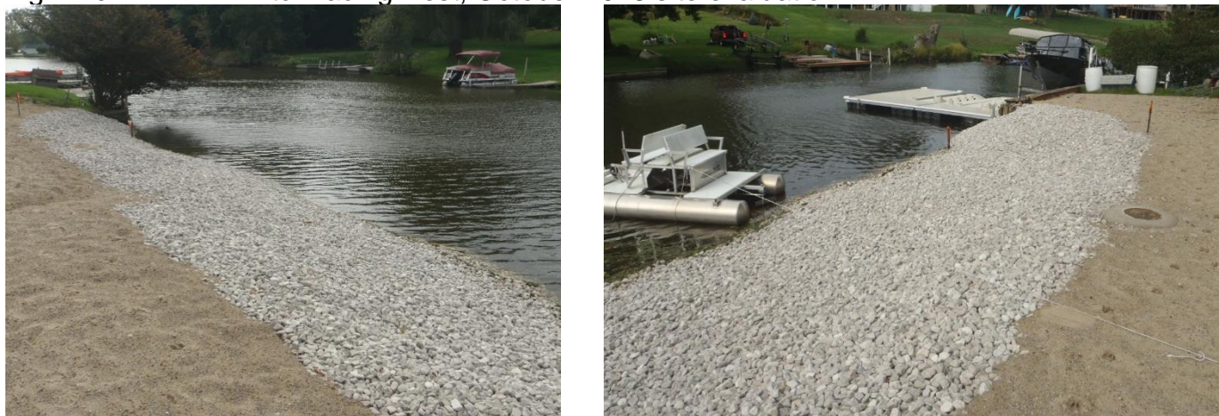
Figure 6. Fenner's Ditch facing west, October 2018 site evaluation.

Remediation activities and restoration work at the former Zephyr site are in various stages of completion. The sediment remediation and wetland restoration along the Muskegon River was completed in 2018. The upland soil and groundwater remediation continue with the next phase targeting off-site contamination, which includes the Bear