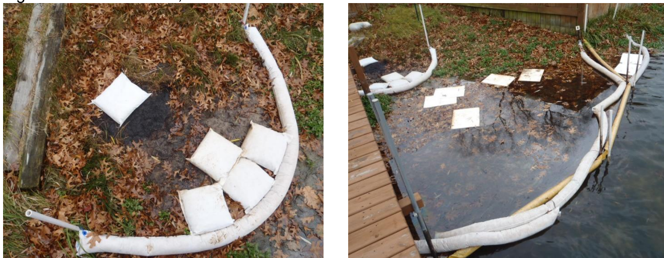
Figure 4. Fenner's Ditch, November 2011 site evaluation.

Both the Bear Creek and Celery Lane sites were impacted by the former Zephyr Oil Refinery on the northeast side of the AOC. Over its lifetime, the company spilled over 700,000 gallons of oil from its bulk storage. The water samples at Bear Creek had no visible issues, and water samples could not be taken at Celery Lane as the water was not deep enough. The water samples at Bear Creek smelled of petroleum, as did the air at both sites. Oil sheens were visible in the wetland east of the Bear Creek site and sheens were seen at Celery Lane, though some of these could have been naturally occurring. Designated uses were considered impaired due to the films at both sites.