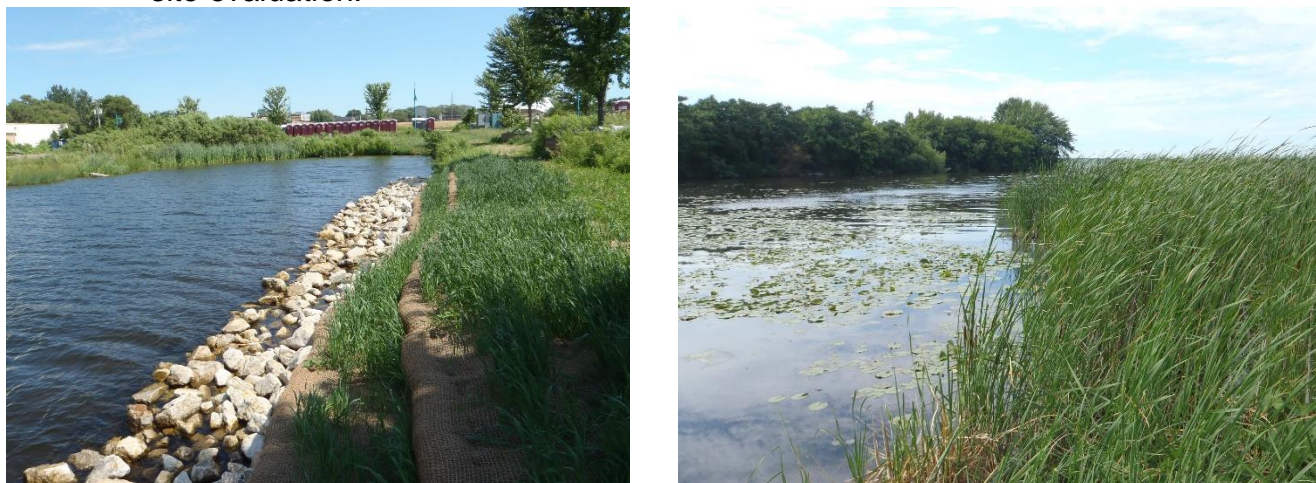
Figure 2. Heritage Landing facing southeast and Grand Trunk facing north, July 2011 site evaluation.

At the Ryerson Creek site, trash and woody debris was observed and the water had a faint odor of sewage (Figure 3). It was clear the buildup of trash was likely due to a poorly sized culvert, which was scheduled to be replaced. Designated uses at this site were considered impaired as there were floating solids in transient conditions.