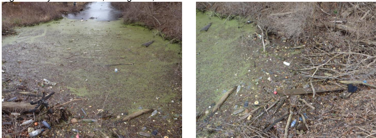
Figure 3. Ryerson Creek, facing east, November 2011 site evaluation.

Fenner's Ditch was the site of an improperly plugged oil well from the 1930s. It was actively venting into the canal on the north side of Bear Lake, which is part of the AOC. During the site evaluations, booms and pads were being used to contain the oil sheens from entering the main waterway (Figure 4). The water samples had a petroleum odor and there was a visible oil film, some of which was in the main waterway outside of the booms. Designated uses at this site were considered impaired due to persistent oil films.