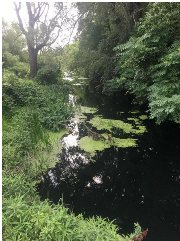
Figure 7. Ryerson Creek facing east and north, July 2021 site evaluation.