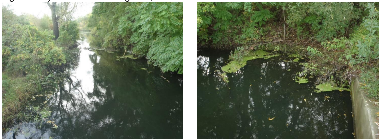
Figure 5. Ryerson Creek facing east, October 2018 site evaluation.

EGLE's Remediation and Redevelopment Division (RRD) undertook a significant remedy effort at Fenner's Ditch in 2018. They designed and constructed an oil cap-and-trap system at the site. The remediation was complete in August 2018 and is effectively keeping oil out of the canal. Water samples from the site were clear and there was no visible debris or oil sheen. The water did have a faint petroleum smell, but odor is not considered an impairment. Designated uses are no longer impaired at this site, and the community can actively use the natural resource (Figure 6).