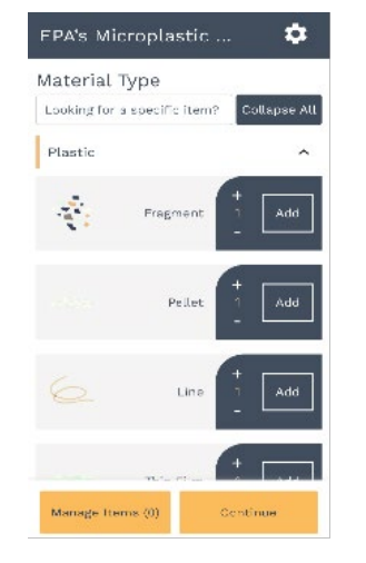
Marine Debris Tracker app microplastics data entry screen.

The TFW Program also recently released EPA's Microplastic Beach Protocol, a tool designed to help community scientists collect data on microplastic pollution along both freshwater and marine beaches and shorelines. Using this protocol, volunteers can collect important data that can be used to characterize current levels of microplastics pollution and look for local, regional, and global trends. The protocol was originally developed by the 5Gyres Institute and has since been updated and revised by EPA. Users are able to access a mobile version of EPA's Microplastic Beach Protocol via the Marine Debris Tracker app. This guide provides an introduction to microplastics, an outline of how to collect and analyze samples using the protocol, and instructions for using the Marine Debris Tracker app to log data.