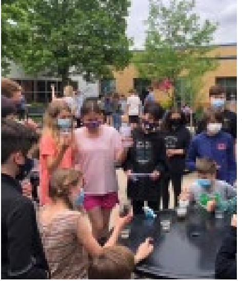
Maple Park Middle School Kansas City, MO – School Art Project made with recycled materials.

Region 7's <u>HEC webpage</u> features resources for parents and educators, a classroom activity sheet including art and trash clean-up ideas, and an explanation for how to get involved in the initiative, including a fun instructional video.