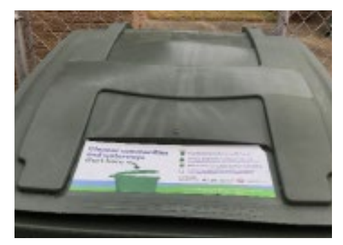
Washington D.C. garbage photographed along the weekly data collection route, featuring the Curbside Disposal Education Campaign sticker and practicing proper disposal behaviors.

Our analysis suggests that although the improvements tended to be small to moderate, this educational program had an overall positive impact on the target communities. In particular, there was a statistically significant reduction in the number of overflowing trashcans and number of overflowing and open trashcans combined across all neighborhoods. EPA is compiling a case study narrative which will provide interested parties with important findings and recommendations to inform